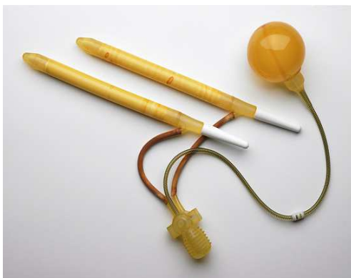
Fig. 3. AMS 700 CX inflatable penile prosthesis