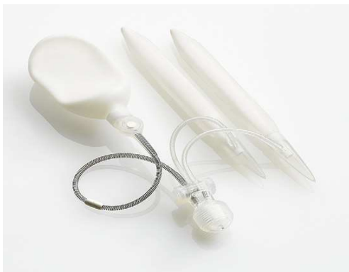
Fig. 2. Hydrophilic-coated Coloplast Titan™ threepiece prosthesis with reservoir lock-out valve to minimize autoinflation