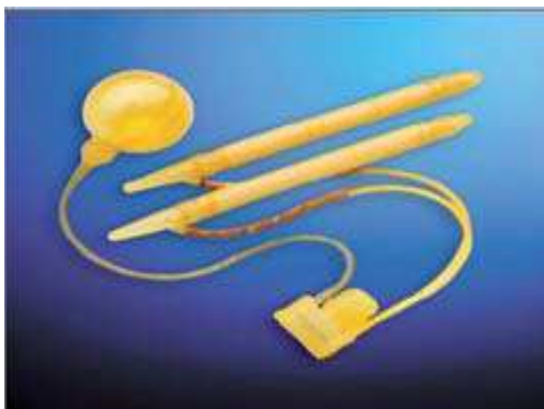
Fig. 5. AMS 700 MS™ series cylinder with InhibiZone® antibiotic surface treatment. AMS = American Medical Systems.

impaired antibiotic penetration due to capsule formation, and decreased wound healing related to scarring. Most bacteria produce a mucin coat or biofilm that is the bacterial colonisation over the device and resistant to systemic antibiotic treatment due to decreased metabolic needs (Silverstein A, et al 2003). Antibiotics or the body's defense mechanisms can not eradicate the bacteria inside the biofilm without removing all prosthetic components and irrigation of the implant spaces (Stewart et al 2001). Both manufacturers developed advances in the designs of prosthesis in order to decrease the incidence of infections by applying coatings to the prosthesis designed to retard bacterial growth. In 2001, AMS introduced InhibiZone™ (Fig. 5) which is a patented antibiotic surface treatment that impregnates minocycline and rifampin into the external silicone surfaces of all the components, except the RTE, giving the orange-like color.