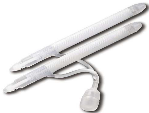
Fig. 1. AMS Ambicor two-piece inflatable penile prosthesis

inflatable. The only two-piece device currently available is AMS Ambicor(Fig.1). When this nondistensible device is deflated, the cylinders collapse and the penis, unlike that with a malleable prosthesis, is not rigid. When the scrotal pump is cycled, a small volume of fluid is transferred from the rear tips of the cylinders into the distal nondistensible chambers filling and then pressurizing them. Different from 3-piece inflatable prosthesis, Ambicor does not increase in size with inflation. Flaccidity and erection are more compromised with this model when compared with 3-piece device due to low, restricted reservoir volume. Also the device is not available with antibiotic impregnated forms as of yet, but has an acceptable short-term mechanical reliability (Levine LA 2001).