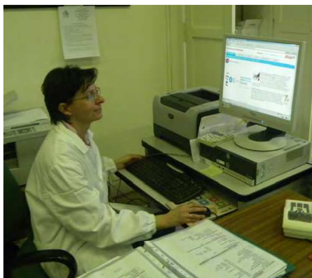
Fig. 4. MyDoctor@Home: Computer work station at HHS office