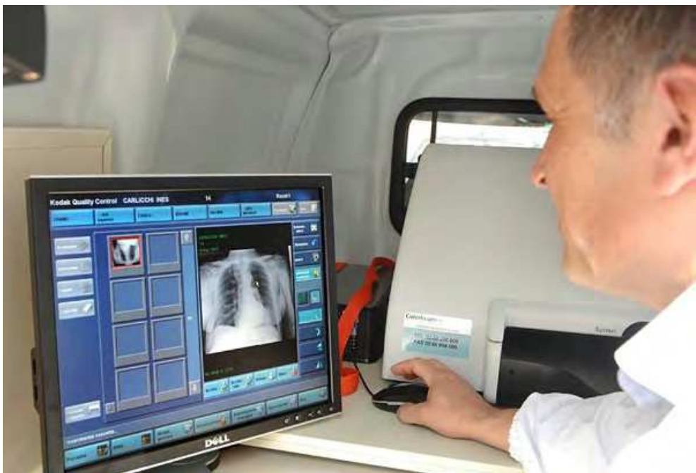
Fig. 6. Mobile tele-radiology station: computed radiography system