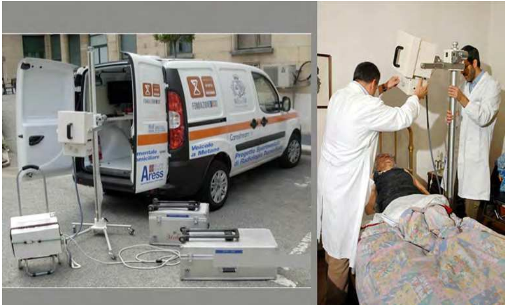
Fig. 5. Mobile tele-radiology station: equipment and Radiology Technicians at patient's home