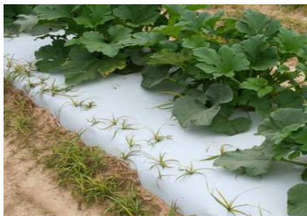
Fig. 2. Yellow nutsedge penetrating white-on-black mulch.

Two common weeds that are not controlled by black plastic mulches are purple and yellow nutsedge. These are two of the most problematic weeds for vegetable production in the Southern U.S. (Webster and MacDonald, 2001). Unlike most weeds, both yellow and purple nutsedge have the ability to pierce plastic mulches (Figure 2) and successfully compete with crops (William, 1976; William and Warren, 1975).