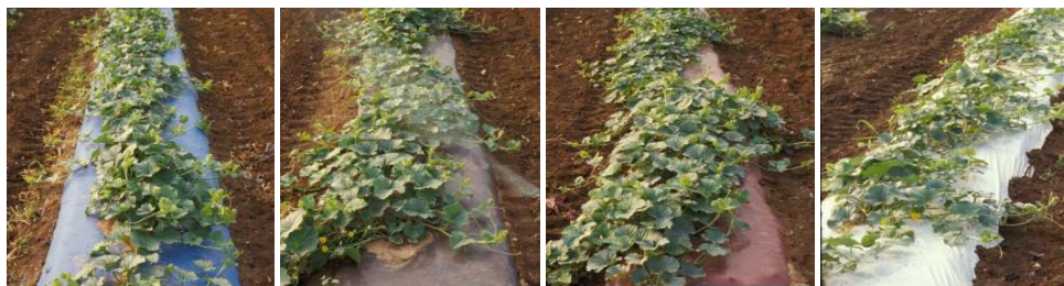
Fig. 1. Muskmelons being grown on blue, brown, red, and white-on-black mulches 1 .

been obtained from colored mulches, particularly red in tomatoes (Decoteau et al., 1989), some allow excessive light transmittance, resulting in unacceptable weed growth. The potential for weed growth and higher costs associated with colored plastic mulches has limited their use.