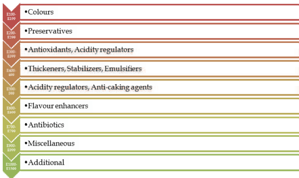
Fig. 2. Classification of additives by numeric range

In the EU, to authorize a substance as a food additive, a reasonable case of technological need, no hazard to consumers at level of proposed use and no misguidance to consumers should be demonstrated. To evaluate whether the newly released food additive has an effect on health; The European Commission is required a consultancy from Scientific Committee on Food (SCF). In this context, SCF deals with questions relating to the toxicology and hygiene in the entire food production chain for consumer health and food safety issues. For submission of a new food additive, the evaluation process by the SCF requires administrative, technical, toxicological data and references (European Commission Health & Consumer Protection Directorate, 2011). Among these, toxicological data obtained from experimental studies have a crucial role for consumers' health due to the presence of any additive in food.