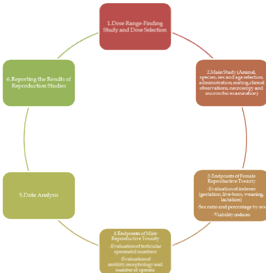
Fig. 3. A reproduction study design by FDA

According to the recommendations of FDA (U.S. Food and Drug Administration, 2007), a toxicity study should be conducted according to Good Laboratory Practice Regulations. The animals used in the study should be well cared and housed according to the recommendations of Guide for the Care and the Use of Laboratory Animals. All test animals should be categorized according to their species, strain, sex and weight or age.