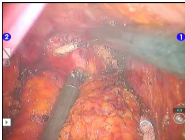
Fig. 5. Intraoperative view: Incision of Denonvillier's Fascia.

The dissection thus continues distal to the rectoprostatic (or rectovaginal) septum: the anterior mesorectal excision is completed, and the rectum is exposed anteriorly to the anorectal junction. A gentle traction of the rectum takes place laterally by a Cadere on the arm #1, on either side, and the dissection is performed by the electrocautery hook until reaching the lateral ligaments of the rectum (LLR). At this level, the dissection is carried out close to the rectum, in order to avoid the injury of the inferior hypogastric plexus (IHP). The dissection must include only the rectal branches from the IHP and the small rectal branches from the middle rectal artery (MRA) (fig. 6).