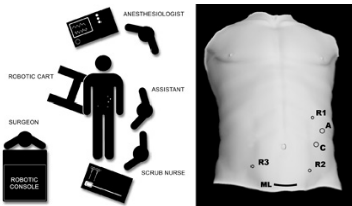
Fig. 1. Operating room setup and trocars position

Patient is placed in supine reverse Trendelenburg position ( 15^\circ to 20^\circ ), with 10^\circ to 15^\circ left lateral rotation and shoulder supports. The legs are secured at the thigh and calf with straps. The table is tilted to the left to allow the small intestine to fall off from the midline. The assistant surgeon stands on the patient's left side. The robotic cart is approached from the patient's right side. The operating room scheme is shown in fig. 1.