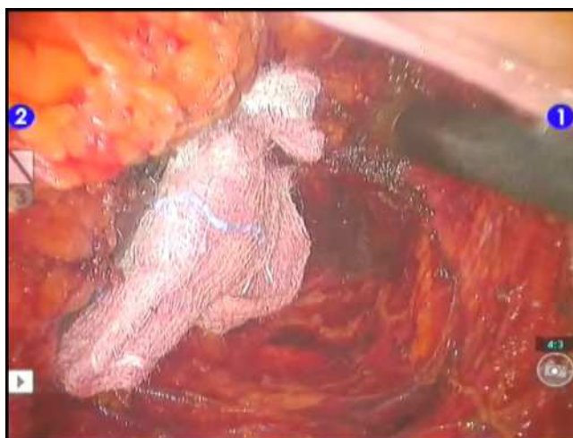
Fig. 6. Intraoperative view: lateral dissection of the rectum

The total mesorectal excision (TME) is finally completed and the rectum is sectioned at its distal end by linear stapler.