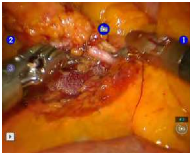
Fig. 2. Intraoperative view: Ileocolic vessels

The procedure begins by grasping upward and laterally the mesentery of the last ileal loop. This maneuver, performed with the forceps mounted on the fourth arm, enhances the prominence of the ileocolic vessels and provides stable and durable retraction. The peritoneal layer of the mesentery is incised just below this salience, and an accurate lymphadenectomy is performed along the superior mesenteric axis. Then, the ileocolic vessels are isolated and separately ligated and sectioned (fig. 2).