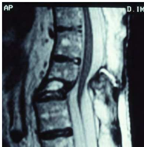
Fig. 2. Lateral MRI of the same case with a Chance type of fracture at T12-L1 level.