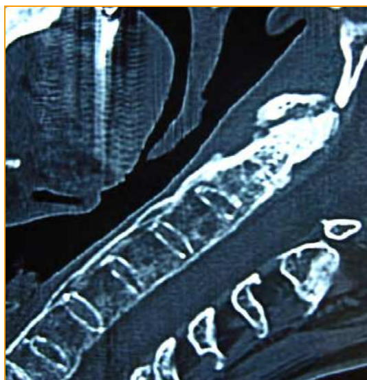
Fig. 4. CT image showing a fracture of the axis at the Cervical Spine.

Surgical treatment is more commonly used, especially in patients with neurologic compromise, obscured visual fields, pseudarthrosis, or recurrent fracture. When traction or internal fixation is used to manage these injuries, the neck should be aligned to prefracture position, not necessarily to a normal position. Minor findings in patients with AS may be associated with substantial instability in the cervical spine, secondary to the altered biomechanics of the fused spine in addition to osteopenia and the concentration of forces at the cervico-occipital and cervico-thoracic junctions. The choice of the stabilization method is depending on the patient's personality, the type of the injury and the surgeon's experience. Currently, surgical stabilization with a rigid fixation is the choice of treatment that many surgeons perform (Figures 4, 5, 6).