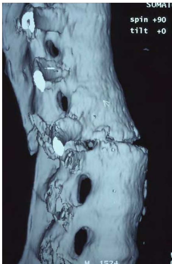
Fig. 3. Lateral 3D reconstruction image of the same case.

Preoperative evaluation of the cervical spine is essential when manipulating the neck during intubation and patient positioning. Physicians also must be aware that, because the atlanto-occipital joint is last to fuse, atlantoaxial instability may occur. Instability is usually demonstrated on lateral flexion-extension views of the neck, where the atlantodens and posterior atlantodens intervals are measured. An atlantodens interval >3.5 mm is indicative of instability. A difference of 7 mm indicates disruption of the alar ligaments, and a difference >9 to 10 mm or a posterior atlantodens interval >14 mm is associated with an increased risk of neurologic injury and usually requires surgical intervention (Kubiak et al, 2005). However, there are no guidelines for the management of atlantoaxial subluxation in patients with AS. Such management is similar to that performed in patients with rheumatoid arthritis (Ramos-Remus et al., 2006).