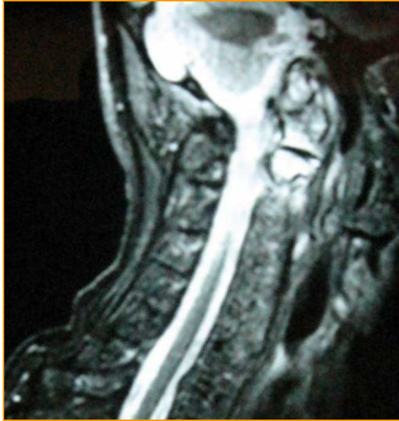
Fig. 5. MRI of the same patient with a fracture of the axis.