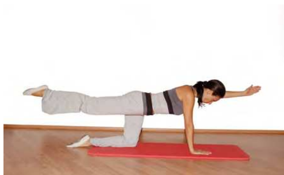
Fig. 4. Stability and endurance training: core muscle activation with limbs exercises