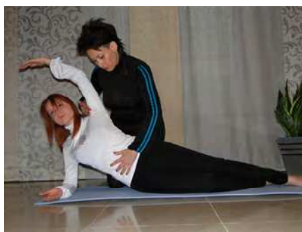
Fig. 5. "Hands on" for body alignment execution

Focusing on the therapeutic movement, particularly in the case of sport injuries helps to avoid errors in repeating the exercises without therapeutic supervision. Proper learning of movement can be also achieved with the help of hands-on guiding, assisting correct movement (touch can improve muscle engagement and relaxation). Verbal cues also play a very important role in increasing awareness of the therapeutic movement being performed and learnt. This applies particularly in the case of a limited amount of information such as typically used with elderly or stroke patients (Lange et al., 2000; Latey, 2000). Verbal cues of the Pilates based exercise instructor as well as his tactile stimulation (hands-on) aim to motivate the exercisers to increase the focus on how to perform movement and maintain the desired body position, so that sensorimotor integration is stimulated. Moreover, connecting the mind and body requires the exercising person to tune into their bodily sensory systems.