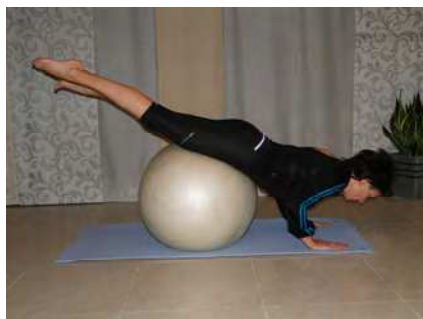
Fig. 10. Push-up exercise on Swiss ball , movement with activation of strong core

It was found that the upper trapezius and serratus anterior are under differing cortical control mechanisms, with trapezius but not serratus demonstrating both contralateral and ipsilateral responses to cortical magnetic stimulation. Increased upper trapezius tone and constant readiness to activate disturbs the humero-scapular rhythm and is also an indication of fatigue or compensation of serratus anterior. As muscle fatigue can be a central phenomenon as well as a peripheral phenomenon, the upper trapezius may have been recruited differently during or after the task. (Alexander et al., 2007, Hunter et al., 2006 as cited in Szucs et al., 2009) It is ball, important that performing Pilates Push-up, which is an exercise in close kinematic chain, serratus anterior muscle should be activated rather than a dominant role of upper trapezius muscle which can be achieved by the alignment of spine, unlocked elbow joints, lower - costal breathing and touching stimulus of an instructor during execution of an exercise.