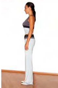
Fig. 3. Postural alignment in standing

in modern Pilates based exercise it is not recommended to start each session with an exercise called "The Hundred", as it used to be in traditional Pilates method. According to Lately (Lateley, 2002) this exercise is particularly arduous as an initial exercise, might be extremely dangerous for someone new to the method, and even under supervision can result in severe injury. The authors concur with Lately on this issue.