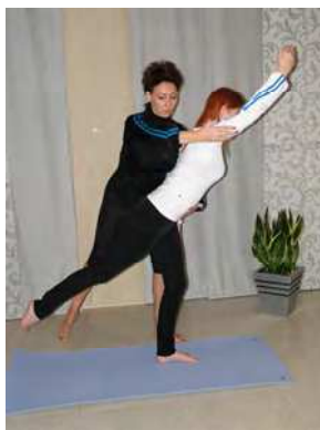
Fig. 7. Execution of strong core with body alignment before and during movement

Pilates method of body conditioning may be generalized to have three major effects upon the powerhouse. First, Pilates affects the posture of the pelvis, which results in postural changes to the lumbar spine. Second, it works directly upon the musculoskeletal structure of the spine (the lumbar spine in particular) by strengthening, stretching, and lengthening the spine. Third, Pilates affects the structural integrity or tone of the abdomino-pelvic cavity as a whole. The posture of the pelvis largely determines the posture of the spine. The spine sits upon the base of the sacrum; therefore, any change in the sagittal posture of the pelvis will change the level of the base of the sacrum. The level of the base of the sacrum will in turn affect the curve of the lumbar spine. However, once the base of the sacrum is uneven to any degree, the spine must have a curve in it to compensate. This curve is necessary to eventually create a level base for the head to sit upon. This righting mechanism to create a level base for the head is necessary to place the eyes and the labyrinthine receptors of the inner ear on a level plane, this being necessary for proper static and dynamic proprioception of our body.