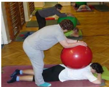
Fig. 2. Sensoric massage with Swiss ball

In physiotherapy praxis Pilates based exercises are also performed with a gymnastic stick, a gym ladder and a stool. Pilates based exercises using a Swiss ball are also very popular, as is sensoric massage with this tool.