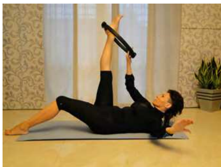
Fig. 1. Multidimensional exercise with Pilates circle

Exercises on professional Pilates' devices are mainly resistance exercise performed with the aid of springs and pulleys, but also stress relief of certain parts of the body can be achieved. The machines can be customized to the needs of the practitioner. The resistance during the exercise allows movement to be isolated and performed in the proper plane. Additional resistance prevents automatic movements being responsible for injuries. The exercises using professional Pilates' devices can be performed in post-acute state of sports injuries.