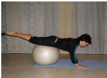
Fig. 9. Push-up exercise on Swiss ball, starting position without “locked elbows”