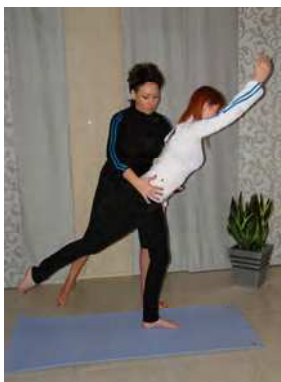
Fig. 6. Manual stimulus for increasing body awareness and desired muscle recruitment

helps to focus concentration. Awareness of the body also assists in reducing overwork, strain and tension. Sportsmen particularly need awareness of their body, particularly the muscular sensations, so as to direct mental and physical efforts efficiently. Attending to the feedback from the proprioceptor system makes the individual aware of what is being done. Precision assists coordination; this is the practical application of focused awareness.