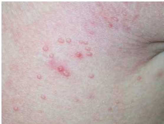
Fig. 3. Molluscum contagiosum. Several 1-2 mm pearly dome-shaped papules with central umbilication (Tlougan et al. , 2010a). Reproduced with permission from International Journal of Dermatology .

Clinical presentation. Individuals present with pearly-white or skin-colored papules and nodules that may demonstrate a central dimple or umbilication (Tlougan et al. , 2010a).