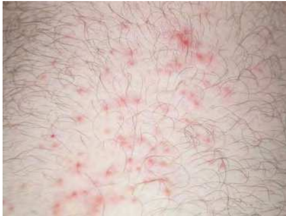
Fig. 2. Swimmer's itch. Scattered erythematous papules on thigh of a swimmer (Tlougan et al. , 2010a).