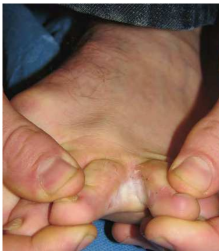
Fig. 5. Athlete's foot. Interdigital subtype of tinea pedis with erythema and scaling between digits (Tlougan et al. , 2010a).

showers or pool decks. Athletes may prophylactically apply topical antifungal agents twice weekly to prevent reinfection (Adams, 2006).