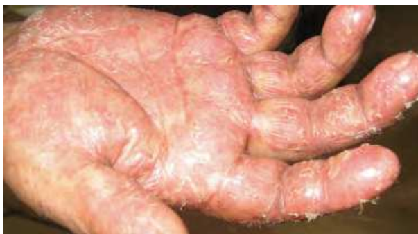
Fig. 10. Fishing rod dermatitis. Erythematous, scaly plaques on the hand (Tlougan et al. , 2010c).

Clinical presentation. Individuals present with unilateral erythematous, scaly hand plaques (Tlougan et al. , 2010c).