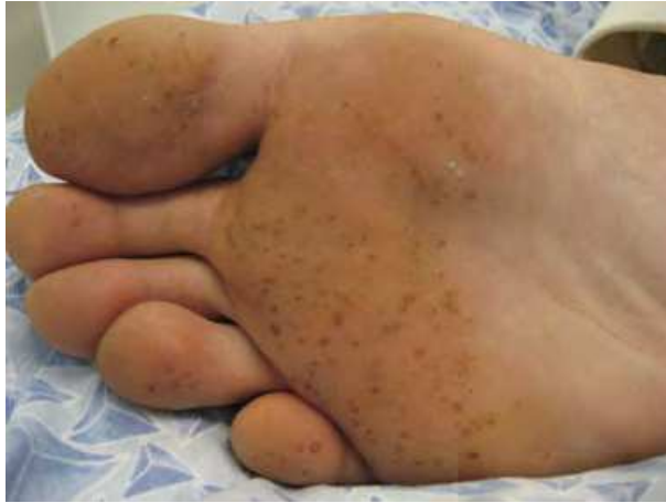
Fig. 1. Pitted keratolysis. Multiple shallow punched-out pits on anterior sole of foot (Tlougan et al. , 2010a).