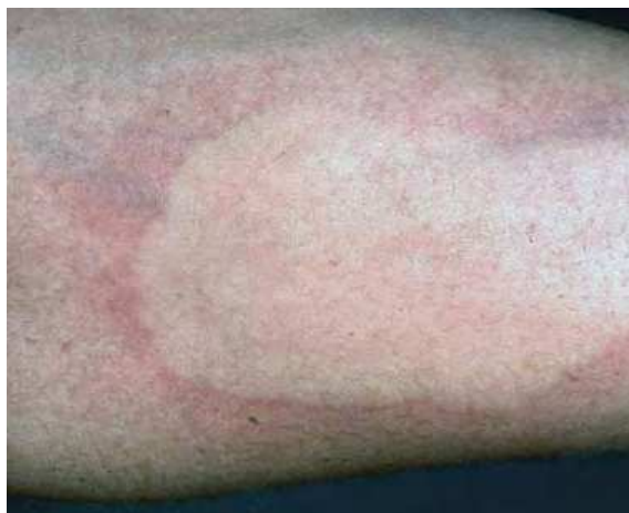
Fig. 7. Cold urticaria. Square urticarial plaque develops after placement of an ice cube on the forearm skin during rewarming of the skin (Tlougan et al. , 2010a). Reproduced with permission from International Journal of Dermatology .

Clinical presentation. Individuals with aquagenic urticaria present with urticarial wheals on any submerged skin surface shortly after contact with water. Occasionally, only a focal urticarial eruption may occur (Shelley & Rawnsley, 1964). Systemic symptoms occur rarely and include headache and respiratory distress (Baptist & Baldwin, 2005; Luong & Nguyen, 1998). Cold urticaria presents with erythematous, edematous papules along cold-exposed skin surfaces that are very pruritic. Individuals may also present with systemic symptoms including anaphylaxis and loss of consciousness which may result in drowning (Sarnaik et al. , 1986). Cold urticaria may be differentiated from aquagenic urticaria by placement of an ice cube on the forearm for several minutes, with resulting development of a square urticarial plaque during rewarming of the skin (Blanco et al. , 2000). Individuals with cholinergic urticaria typically present initially with itching or burning, with subsequent development of flushing and hives minutes after the onset of physical activity (Jorizzo, 1987). The diagnosis is supported by exercise testing, sauna test or hot bath challenge with a resulting urticarial eruption (Jorizzo, 1987).