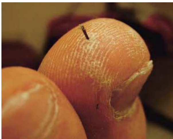
Fig. 9. Sea urchin spine. Spine punctured through the skin with resulting pain, redness and swelling (Tlougan et al. , 2010b).

Clinical presentation. Individuals in contact with the spines of seastars may present with puncture wounds and a burning sensation which may persist for one month (Auerbach, 1991). Contact with sea urchin spines may result in a painful puncture wound with surrounding erythema and edema, while broken spines may remain lodged in the skin. Rarely, tenosynovitis and systemic reactions including nausea, syncope and respiratory distress may occur (Baden, 1987). Contact with sea cucumbers may present as a burning irritant dermatitis. The sea cucumber toxin holothurin, a potent cardiac glycoside, may cause a chemical conjunctivitis and even blindness, while ingestion may result in death (Tlougan et al. , 2010b).