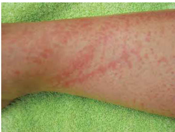
Fig. 8. Jellyfish sting. Linear erythematous plaques, which may be vesicular or urticarial (Tlougan et al. , 2010b). Reproduced with permission from International Journal of Dermatology .

Individuals stung by sea anemones present with an initial stinging or burning sensation with erythema, edema, petechial hemorrhages and ecchymoses. Eventually, an erythematous, papulovesicular eruption develops and local necrosis, ulceration and desquamation may occur (Halstead, 1988). Bathing or showering exacerbates the stinging or burning sensation. Severe side effects include acute renal failure and fulminant hepatic failure (Garcia et al. , 1994; Mizuno et al. , 2000). Seabather's eruption results from contact with larvae of the adult sea anemone and the thimble jellyfish and presents similarly with systemic symptoms occurring in up to 10% of cases. (Freudenthal & Joseph, 1993; MacSween & Williams, 1996; Sams, 1949; Tomchik et al. , 1993).