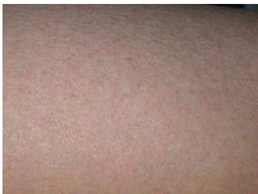
Fig. 6. Pool dermatitis. Eczematous plaques in uncovered areas in a swimmer (Tlougan et al. , 2010a).

Pool dermatitis is an irritant dermatitis to chemicals in swimming pools, particularly chlorine and bromine.