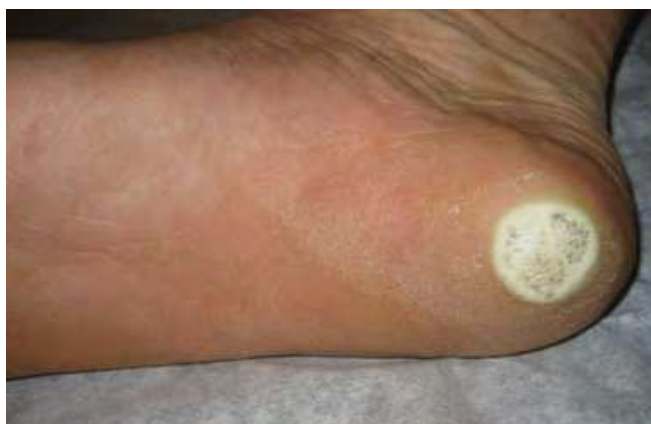
Fig. 4. Verrucae. Plantar wart with roughened surface and black specs at the center (Tlougan et al. , 2010a).

Management. Therapeutic options include mechanical destruction with liquid nitrogen, laser and curettage. Methods of chemical destruction include salicylic acid, cantharidin and trichloroacetic acid. Athletes may apply imiquimod, 5-FU, squaric acid (SADBE) and diphenylcyclopropenone (DPCP) for self-management of these lesions. (Tlougan et al. , 2010a). Recalcitrant warts may be treated with injected Candida antigen , mumps antigen or bleomycin. (Tlougan et al. , 2010a). Oral cimetidine has been shown to be effective in some studies, although its clinical utility remains debated (Orlow & Paller, 1993; Tlougan et al. , 2010a).