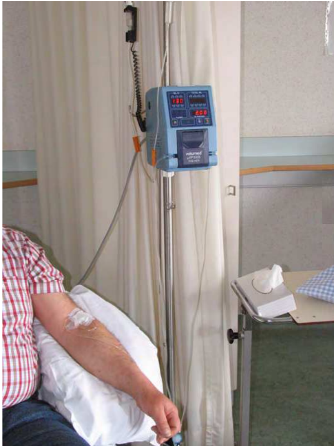
Fig. 1. Infusion in specialized unit

advantages and disadvantages. Many patients appreciate the simplicity of infliximab's dosage schedule: half a day in hospital every eight weeks seems much easier than more regular injections at home. Patients often say: "at least, with the drip, I can forget about psoriasis and its treatment completely for two whole months". Patients do not have to go to the pharmacy on a regular basis, keep boxes in the family refrigerator, or have a nurse repeatedly visit their house (figure 1).