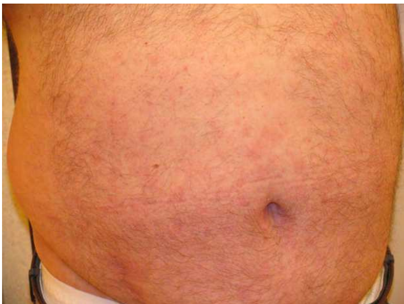
Fig. 3. W10, complete response

percentage between 75 and 89%. Just 4 remained with an improvement of 'only' between 50 and 74%. 6 patients are considered to have a primary resistance to treatment as they have never obtained a 50% reduction in their initial severity. These six patients cannot be distinguished from the others on the basis of age, sex, comorbidity, or prior treatments received. No characteristics predictive of response emerged from our series.