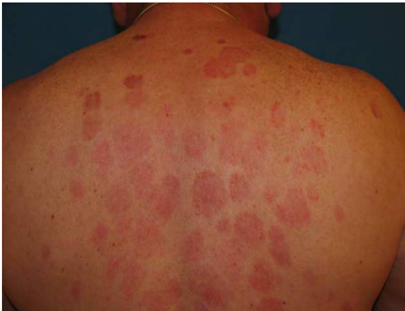
Fig. 5. W6, PASI75 response with erythematous sequelae

The major problem is to psychologically and medically manage losses of clinical response. But for patients with a sustained complete response, the dermatological quality of life is perfect.