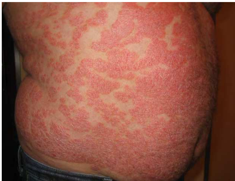
Fig. 2. W0, baseline

Clinical response is often excellent. Primary response must be distinguished from more long-term response. Primary response is immediate efficacy, generally deemed at 10 weeks for infliximab. The more long-term response is the persistence of efficacy, without relapse; there is no defined timeframe for measuring this. We will therefore talk about a 1-year or 2-year response, etc. For this study, we analyzed the long-term response according to the clinical practice at the time of file analysis, so 1 to 4 years after the beginning of treatment.