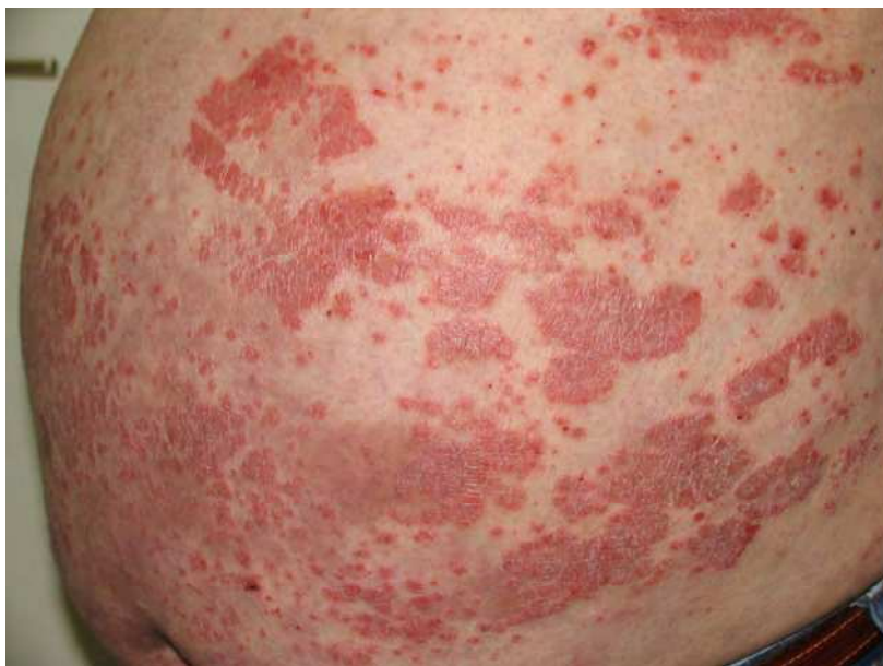
Fig. 4. W46, partial relapse