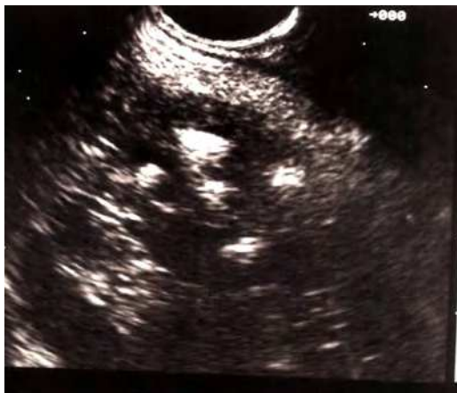
Fig. 2. Echoendoscopic image showing multiple hyperechoic areas with posterior acoustic shadow in a patient with calcifying CP.

calcifications (Figure 2) (2,9-11). Intravenous injection of secretin may be useful in early forms of CP, enhancing discrete changes in MPD caliber (12). Sensitivity and specificity of ultrasound to diagnose CP ranges from 50 to 70% and 80 to 90%, respectively (6, 10, 13).