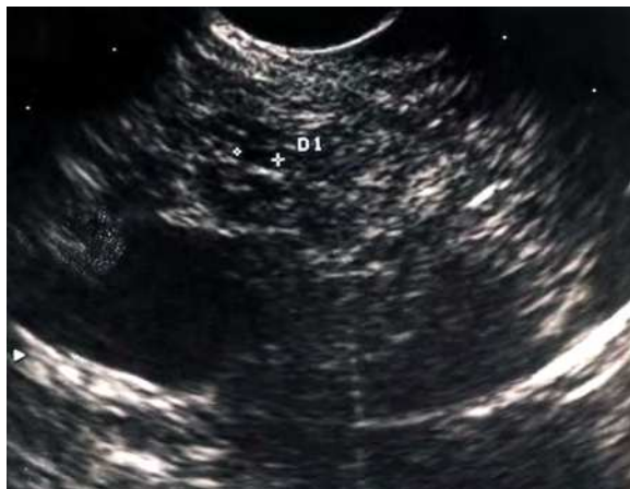
Fig. 7. Echoendoscopic image of pancreas showing parenchymal changes such as: longitudinal hyperechoic streaks, hypoechoic areas, secondary duct dilation and hypoechogenicity of the entire gland.

Diagnosis of early stage is a huge challenge. The inability to obtain biopsies makes this presumptive diagnosis difficult. The available diagnostic imaging methods do not offer greater benefits. EE is a promising diagnostic modality and unlike ERCP does not have the same complication rate. Minimal changes in echotexture are difficult to interpret because there is no gold standard (Figure 7).