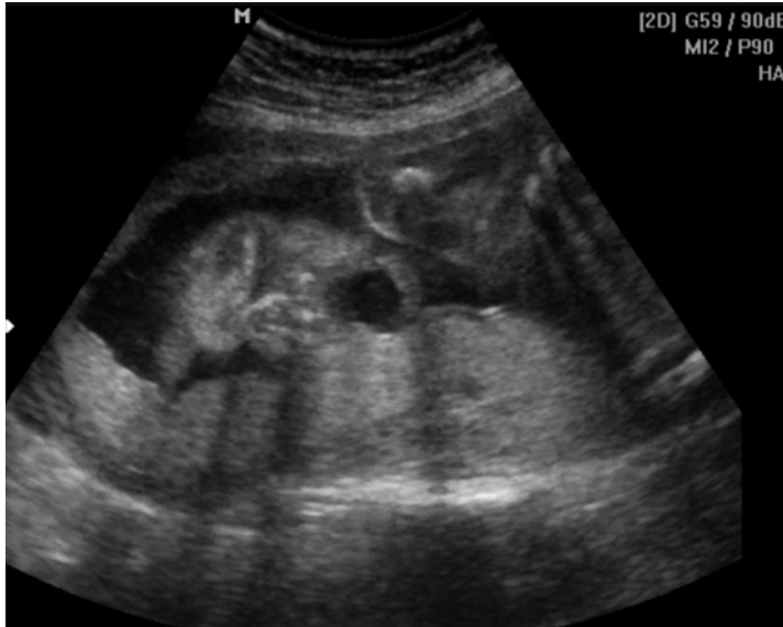
Fig. 4. Fetal yawn at 23 weeks of pregnancy (2D). Fetus weighing 200g

longitudinal fasciculus (MLF), pontine tegmentum, raphe nucleus and locus coeruleus, which exert widespread influence on arousal, including the sleep-wake cycle. Therefore, these structures exert tremendous influence on gross body movements, head turning, heart rate, and respiratory movements, as well as swallowing, yawning, suckling, hiccups, and 7 facial grimacing movements (Santagati, 2003; Kontges, 1996; Jacob, 2000; Sadler, 2009) (Fig. 1).