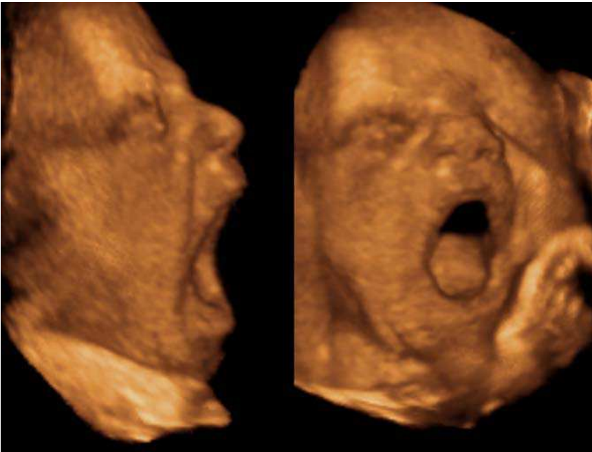
Fig. 3. Fetal yawn at 23 weeks of pregnancy (3D). Fetus weighing 200g