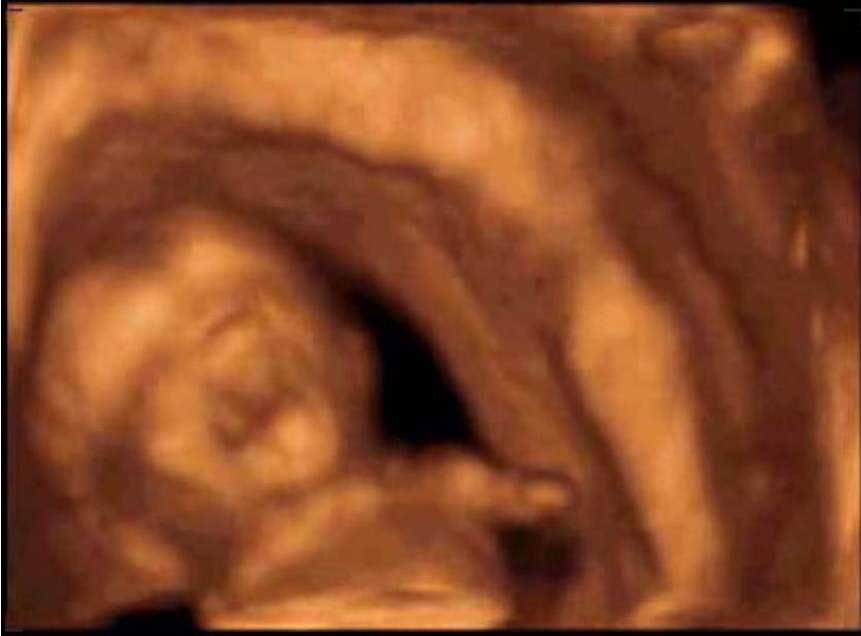
Fig. 2. Fetal yawn at 12 weeks of pregnancy (3D). Fetus weighing 80g