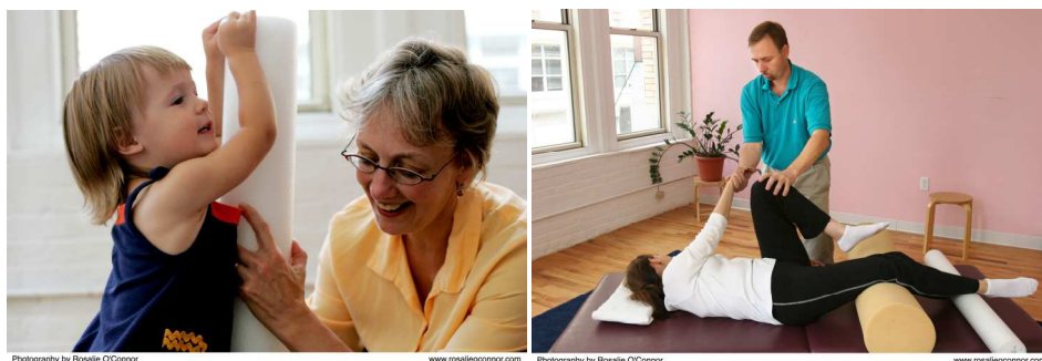
Fig. 1. Examples of Functional Integration lessons.

Functional Integration lessons (see Fig. 1) use manual contact between teacher and student to guide the student to better understand current patterns of behavior and inform the student in a manner that facilitates self-organization of alternative, improved behavior (Feldenkrais, 1972, 1981, 2010). Students are comfortably clothed during lessons that usually last 30-60 minutes. Teachers use supportive, non-invasive touch that can be informative to both students and teachers. Teachers individualize lessons to target functional goals expressed by students, while using principles and techniques common to the Feldenkrais Method . Some of these include: creating a sense of safety with respectful touch and support of body parts; moving limbs through pathways of minimal resistance to suggest more optimal movement trajectories; clarifying existing habitual patterns of positioning and organization to facilitate reorganization; compressing, lengthening, or guiding other movements with emphasis on contact that is as if it were skeleton-to-skeleton; and positioning parts so as to shorten muscles, facilitate decreased contractile activity, and allow more lengthening without stretching (Feldenkrais, 1972, 1981, 2010; Ginsburg, 2010).