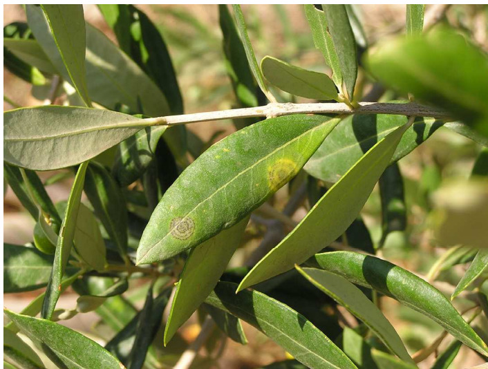
Photo 1. Olive leaf spot

Since the disease most often attacks leaves, it is on them that the symptoms are most conspicuous (Photo 1).