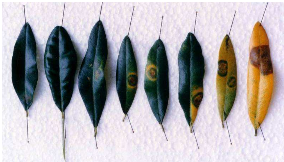
Photo 2. Symptoms of the disease

infection the leaf skin detaches from the epidermis, causing the spots to turn white (Photo 2). In rare cases, the symptoms of the disease also occur on the undersides of leaves, as well as on stems and fruits.