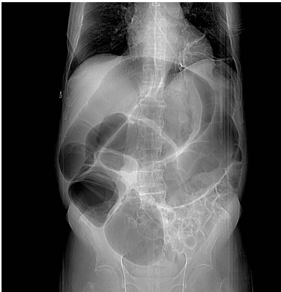
Fig. 1. Distension of colon in pseudo-obstruction

patients present with dimensions greater than this without sequelae [45] . Colonic haustral and mucosal patterns are often maintained on X-rays. Transition from proximal dilated to decompressed colon is usually seen at the splenic flexure. Distension of colon follows Laplace's law which states that pressure required to stretch the walls of hollow viscus varies inversely with its radius [46] . Laplace's law is T=P*R/2 where T is wall tension, P is transmural pressure and R is radius of bowel. Cecum is more vulnerable to distension and perforation as it is the widest part of the colon. Serial plain abdominal x-rays are useful in cases of chronic pseudo-obstruction as they are less likely to perforate than acute obstruction. Serial x-rays are needed to monitor the progress of conservative therapy and to guide further management.