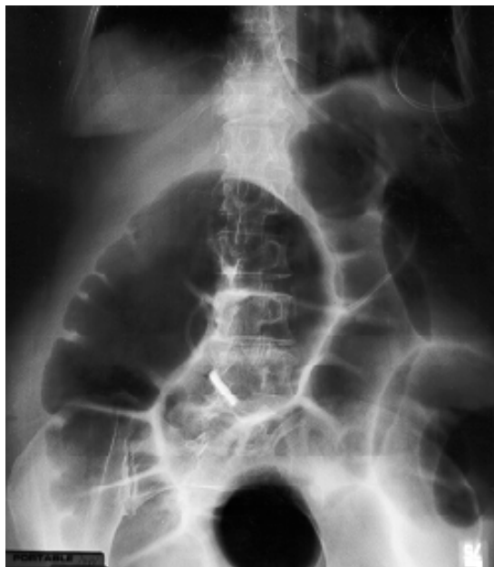
Fig. 2. Transverse colon distension in pseudo-obstruction

passage of gas into distal colon. This facilitates the gaseous filling of the rectum when the patient is positioned for a prone lateral view of the pelvis. He found 75% success rate in excluding mechanical obstruction when there was gaseous filling of rectum.