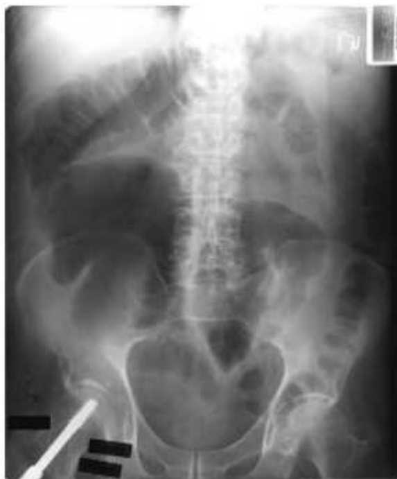
Fig. 3. Distension of the right colon post femoral fracture