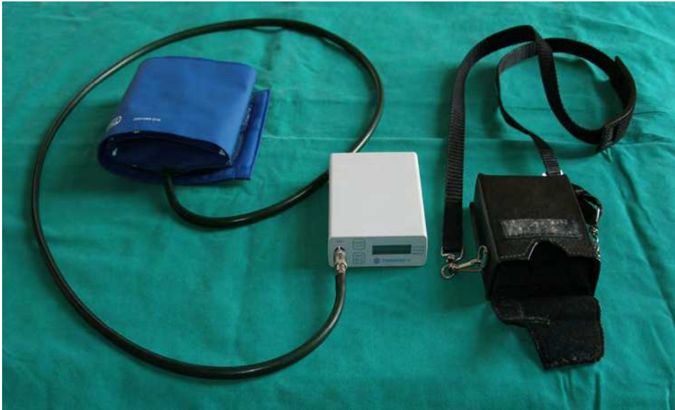
Fig. 2. CardioSoft - Tonoport - V - General Electric, USA device used for 24-hours ABPM

Figure 3 shows audiogram with bilateral symmetric perceptive acoustic disorder. Then we performed internal examination and indicated a 24-hour ambulatory blood pressure monitoring (ABPM). We used for this examination CardioSoft-Tonoport V-General Electric, USA device, which uses oscillometric method of measurement of blood pressure. None of the group member has previous known diagnosis of arterial hypertension, or use of any medication altering blood pressure level. As some medications can evoke or strengthen tinnitus thoroughly, history of patient's medication is very important (Holcát, 2007).