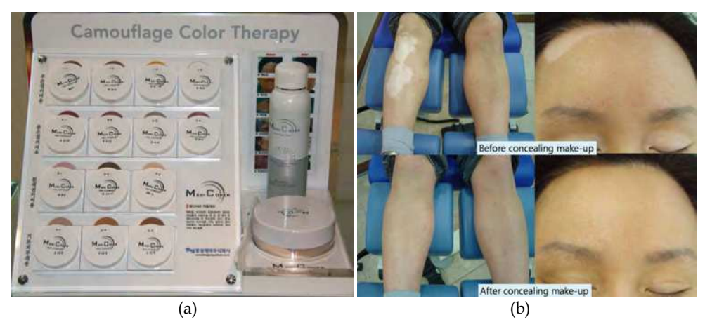
Fig. 6. (a). Concealer cosmetic set for vitiligo patients. (b). Patient before and after makeup.

Special makeup products are also helpful. Cosmetics are limited by their easy removability (can be washed away by sweat) and they can be messy (get on clothing), however tend to give vitiligo lesions the most natural skin color. Many patients prefer makeup, which can achieve cosmetically acceptable results in an investment of 20 minutes a day. Special makeup is acceptable, but it is more effective when combined with DHA or walnut solution. Figure 6 shows a patient before and after makeup. To maintain the stability of makeup where it is applied, non-glossy hair spray (Korean) or Cavilon 3M<sup>TM</sup> spray (Tanioka & Miyachi, 2008) can be used after application of makeup. Some KAV patients use spray-on stockings on a DHA-primed leg lesion and results are often satisfactory. However, it is difficult for beginners to produce satisfactory results using various makeup products. The methods using DHA, walnut shell, and special makeup products all require hours of patient teaching and practice. Tanioka and Miyachi (2009) also emphasized the importance of lessons in camouflage techniques.