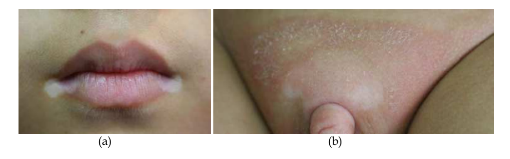
Fig. 3. A. Vitiligo on angles of mouth. B. Vitiligo associated with atopic dermatitis and diaper dermatitis.

Enough rest and appropriate treatment can help vitiligo in the "T-zone" areas where seborrheic dermatitis commonly occurs. If a lesion appears in areas which have a predilection for atopic dermatitis, doctors should pay special attention to treatment of the skin lesion. Adjunctive use of ketotifen and gamma-linolenic acid is useful. For the patient in Figure 3B, phototherapy as well as treatment for atopic dermatitis and diaper dermatitis would be necessary.