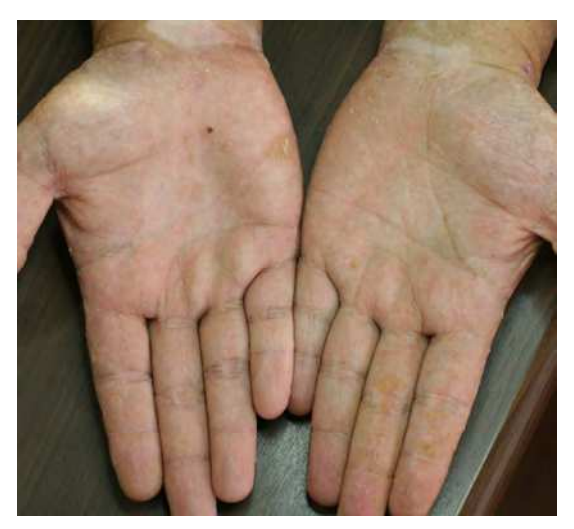
Fig. 4. Arsenic keratoses in vitiligo patient

applying them to the skin can improve vitiligo. Nevertheless, it is more beneficial not to use these in terms of potential risks involved.