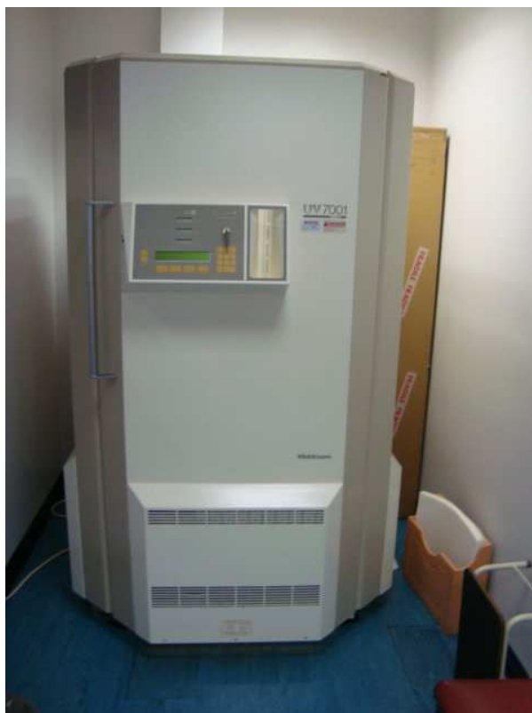
Fig. 1. A Narrowband UVB body box

Ultraviolet B (UVB) phototherapy is one of the most common vitiligo treatments used in the world today, and has evolved from the use of broadband ultraviolet B (BB-UVB) lamps to narrow-band ultraviolet B (NB-UVB) machines (Figure 1) with an emission spectrum of 310-315 nm (e.g. Philips TL-01). Vitiligo was the second most frequently treated disease by NB-UVB reported in a review published from a major U.S. phototherapy referral centre.