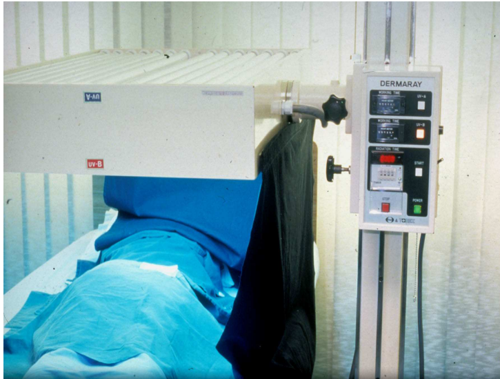
Fig. 2. A targeted UVA light source for PUVA therapy

solution or have the solution directly applied to affected areas. Psoralens may not be used in pregnancy and there is a higher risk of burns, cutaneous malignancy and eye injury.