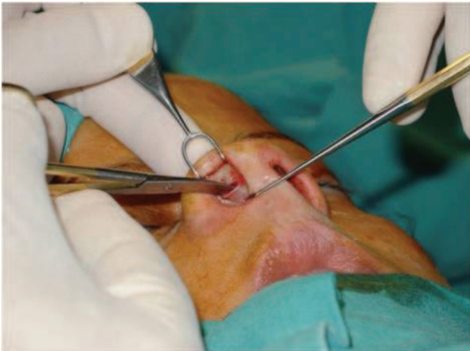
Fig. 2. The cephalic piece of the alar cartilage is dissected and resected

The advantage of this modified approach over the traditional delivery approach is avoiding the intercartilaginous incisions. The dense collagen tissue between the upper lateral and the alar cartilages will not be severed by using a transcartilaginous incision, thus preventing weakening of the tip support. It has been shown that dividing this fibrous tissue has much more effect on releasing tip structures than dividing any other soft tissue important to the tip support mechanisms (6), emphasising the importance of keeping this tissue to maintain a strong tip support.