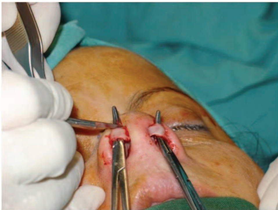
Fig. 5. The remaining alar cartilages are delivered and compared; if necessary, further resection is performed to achieve perfect symmetry or the desired size

We have been using this modification of the delivery approach for several years. In the earlier cases, we used this modified delivery approach only for patients with long alar cartilages (in the cranial-caudal direction) and a wide or bifid nasal tip. We felt that this kind of tip required performing cephalic resection of the alar cartilages plus, if nothing else, a double dome suture. We felt that this modification could make the delivery of long alar cartilages easier and safer, as the cartilage would not be under tension or under a twisting strength at any stage of the procedure. In more recent cases, we have been using this approach for most cases of refinement of the nasal tip, as long as this involved more than just cephalic resection of the alar cartilages. Thus, we have been using the modified delivery approach in almost every case that we would, otherwise, be using the standard delivery approach.