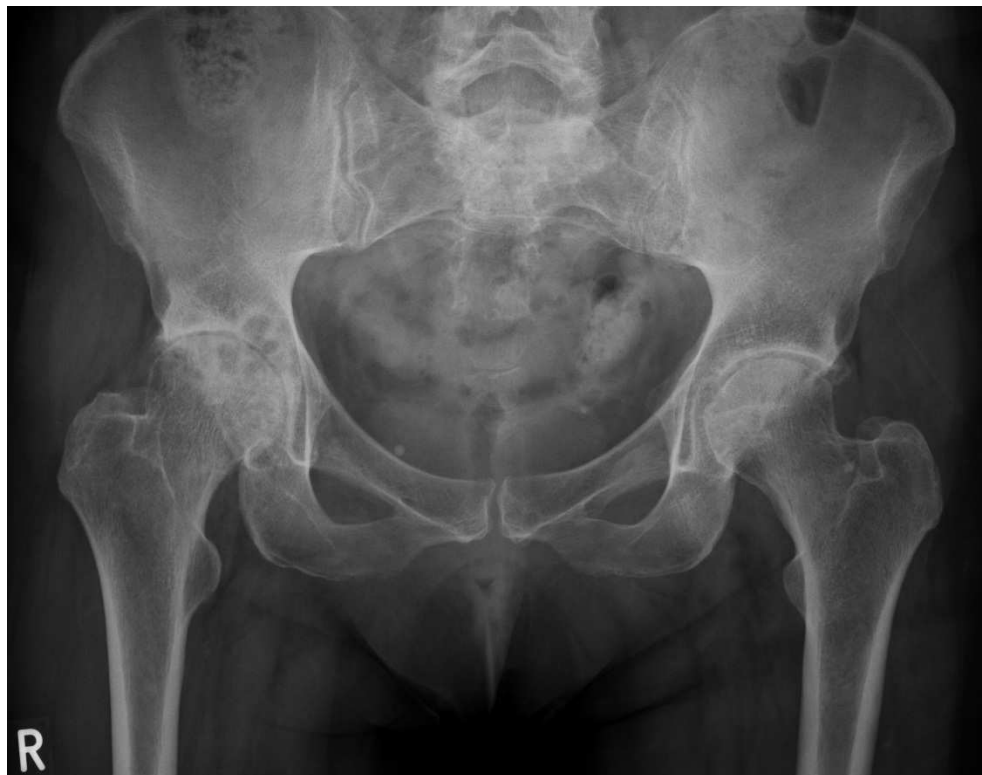
Fig. 1. Anteroposterior radiograph of the pelvis showing, right hip osteoarthritis with a triad of joint space narrowing, subchondral cysts and osteophyte formation.