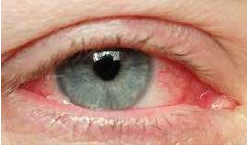
Fig. 2. Viral conjunctivitis (Look for pink eye without any discharge)

Herpes infection of the eye may be acquired as the patient's first exposure to the virus (primary infection) or as involvement of a new anatomical site (the eye) in a patient with previous HSV infection. In either case, patients with herpetic eye infection risk recurrent eye disease throughout their lives. The infective lesions of the corneal epithelium (dendritic and geographic ulcers) occasionally develop into non-infective indolent or trophic ulcers, particularly under the influence of cauterizing chemicals or corticosteroids. Inflammation of the corneal stroma may accompany herpetic epithelial lesions or occur independently. Stromal keratitis probably represents the host's immune response to viral antigens filtering down from epithelial lesions or from viral replication in stromal cells.