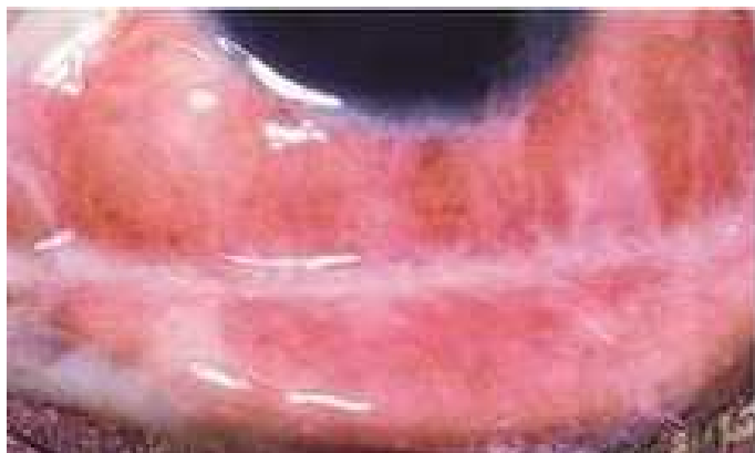
Fig. 1. Bacterial conjunctivitis (Look for the mucous discharge)

soaked with warm water, and to explain the same procedure to the patients, so they can do in home before applying medications. Generally most of the bacterial conjunctivitis cases are treated as outpatient cases but whenever any corneal involvement is suspected it would be ideal to treat the patient as an inpatient.