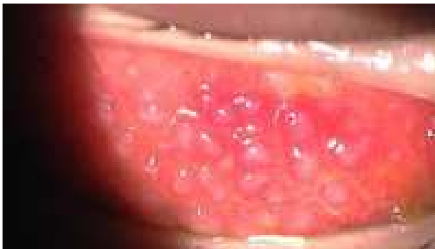
Fig. 3. Allergic conjunctivitis (Look for follicles and papillae)

Allergic conjunctivitis comprises a group of diseases affecting the ocular surface and is usually associated with type 1 hypersensitivity reactions. Two acute disorders, seasonal allergic conjunctivitis and perennial allergic conjunctivitis, exist, as do 3 chronic diseases, vernal keratoconjunctivitis, atopic keratoconjunctivitis, and giant papillary conjunctivitis.