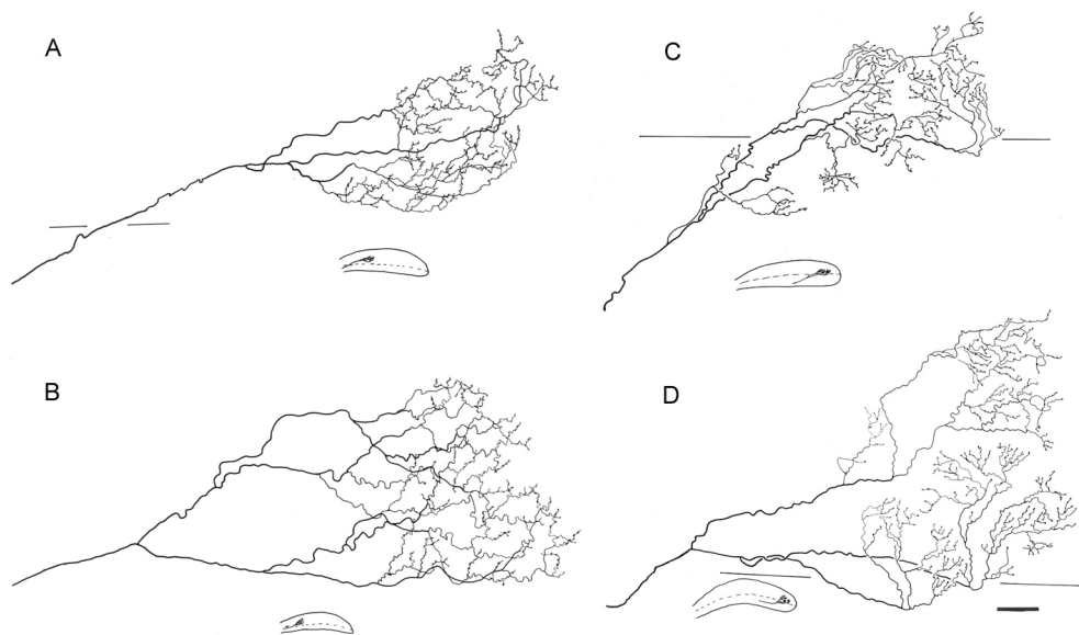
Fig. 2. Camera lucida drawing of the axonal arbor in the mid rostral (Fig. 2A) tectal region of a normal rat, total area of the terminal was 11250 \mu\text{m}^2 . In the glaucomatous animal, the area of terminal axonal arbor at similar location to the normal was 12480 \mu\text{m}^2 (Fig. 2B). In the caudal tectum of normal rat, the area of the normal optic axonal terminal was 14290 \mu\text{m}^2 (Fig. 2C) whereas it was 18060 \mu\text{m}^2 in glaucomatous side (Fig. 2D). It was also noted that these were less vericosities and relatively less dense boutons when compared to the normal

Anatomical evidences for observed enlargement of receptive fields in experimental glaucoma point to the increase in the axonal terminal arbors of the remaining retinal ganglion cells axons in the contralateral superior colliculus. Figure 2 shows the morphology of RGC axonal terminal in the superior colliculus. The axons at proximal and distal portion of superior colliculus (Figure 2A and 2C) in the normal IOP animal are displayed. With elevation of IOP for 4 months, the axons at the same level were enlarged and more terminal branches were identified (Figure 2B and 2D). This suggests that surviving axons may occupy the territory of the dead axons.