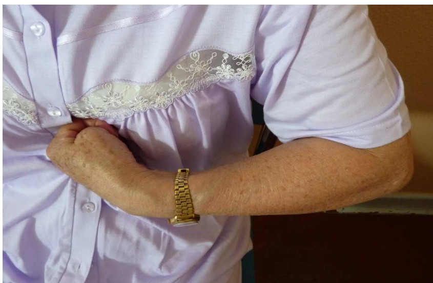
Fig. 1. A fixed dystonic posture of psychogenic origin

Controversial patients are those with dystonia developing within hours or days after a minor injury, with a fixed dystonic posture and severe pain. This kind of dystonia may be associated with features of complex regional pain syndrome type I. A study by Schrag and co-workers show that a substantial proportion of patients with fixed dystonia clearly fulfils criteria for a psychogenic dystonia (37%) or somatization disorder (29%). Although fixed dystonia sometimes developed in patients in whom a diagnosis of somatization disorder had already been made, a history of somatization was often unrecognized and, in many cases, only became evident after examination of primary care records (Schrag et al., 2004; Miyasaki et al., 2003). Various features of complex regional pain syndrome-related fixed dystonia suggest abnormal regulation of inhibitory interneuronal mechanisms at the brainstem or spinal cord level and impairment central synaptic reorganisation due to an interaction between neuroplastic activities and anomalous environmental necessities (Munts & Koehler, 2010).