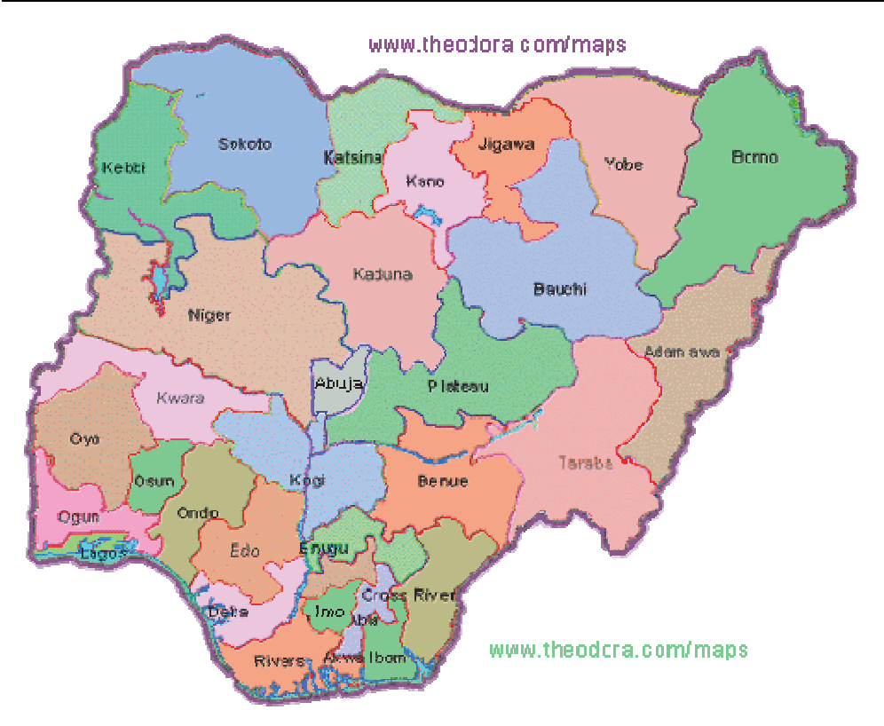
Fig. 1. Map of Nigeria showing the 36 states

council predicted that Nigeria and Ethiopia would be especially hard hit, with the number of people living with HIV/AIDS in Nigeria projected to balloon to ten to fifteen million by 2010, or as much as 26 percent of the adult population. Without effective prevention on a large scale, Nigeria will experience not only the tragedy of countless lives forever altered by the virus, but also untold adverse social and economic effects. In Nigeria the prevalence of HIV has increased from 1.8% in 1991 to 3.8% in 1993, 4.5% in 1999, 5.8%, 5.0% in 2003, 4.4% in 2005 to 4.6% in 2008 (Federal Ministry of Health Nigeria, 2009). Nigeria's population has grown rapidly in recent decades. In 1991 the total population was 88.9 million, and projections by the National Population Commission of Nigeria estimated that by 2003 the population would rise to 133 million (National Population Commission of Nigeria, 1991). The prevalence of HIV in Nigeria may not be as high as it is in most countries in Southern part of Africa. The prevalence is however significant considering the population of the country. There has been great concern in the international community as to whether Nigeria with her sub-optimal health infrastructure will be able to manage this pandemic.