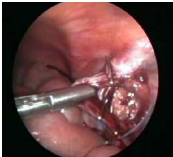
Fig. 4. Left int. spermatic vein after clipped applied