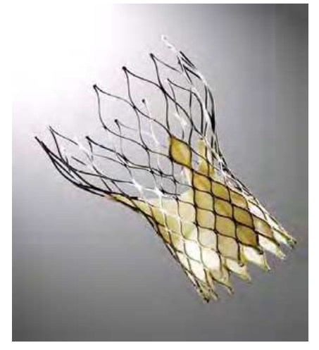
The Core Valve

The new Edwards Lifescience device, the Sapien-XT valve, can be delivered by an arterial or venous access site (anterograde or retrograde technique) as well as by a transapical approach; it has the CE mark since 2007 and has the FDA investigational device exemption for the PARTNER US trial. Like the CoreValve system, more than 10.000 devices have been implanted all around the world with promising initial results. It is constructed with a bovine pericardium valve sewed to a balloon expandable chromium-cobalt stent to be anchored to the calcified native aortic annulus. Three sizes are commercialized: 23mm (for aortic annulus between 18 and 21mm), 26mm (for aortic annulus between 21 and 25mm) and the recently added 29mm size for annulus over 25mm. The femoral sheath is 18F for the smaller size and 19F for the 26, and the transapical sheath is 22F for the smaller, 24F for the 26mm size and 26F for the 29mm. No femoral system has been designed yet for the 29mm valve.