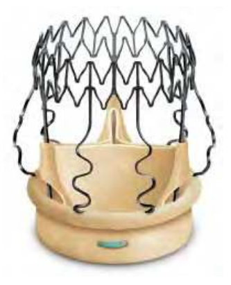
Perceval Sorin Valve