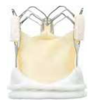
Enable 3F Valve