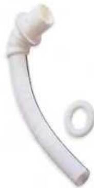
Aorto-apical conduit Medtronic Hancock

Surgical aortic valve replacement by median thoracotomy under cardiopulmonary bypass is, as mentioned above, the standard therapy for severe aortic stenosis that has proven superiority to conservative pharmacological therapy. Many times, however, this treatment cannot be performed because of different technical, anatomic or clinical problems that the patient may present, as it could be porcelain aorta or tiny aortic annulus. Aortic valve conduits, also known as apicoaortic conduits, are a sort of devices designed in the sixties to give an alternative in these situations. Apicoaortic conduits connect the left ventricle apex with the descending thoracic aorta, relieving the intraventricular pressure by allowing the blood flow to find a way out of the heart without fighting against the aortic valve resistance. Because the operation was technically difficult, it had fallen into disuse, but, with the introduction of technically easier and less invasive procedures performed by minithoracotomy, this alternative offers clear advantages over standard valve replacement (avoidance of sternotomy, cardiopulmonary bypass, cardioplegic cardiac arrest, native valve debridement, conduction system injury, aortic cannulation, and aortic cross-clamping) and arises as another option in addition to transcatheter aortic valve implantation as alternative therapy for high risk patients. This technique offers the possibility to choose from a big variety of valve models and sizes, it