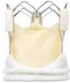
Enable 3F Valve