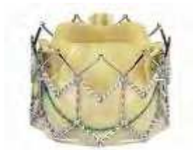
The Edwards Sapien XT valve

The new Edwards Lifescience device, the Sapien-XT valve, can be delivered by an arterial or venous access site (anterograde or retrograde technique) as well as by a transapical approach; it has the CE mark since 2007 and has the FDA investigational device exemption for the PARTNER US trial. Like the CoreValve system, more than 10.000 devices have been implanted all around the world with promising initial results. It is constructed with a bovine pericardium valve sewed to a balloon expandable chromium-cobalt stent to be anchored to the calcified native aortic annulus. Three sizes are commercialized: 23mm (for aortic annulus between 18 and 21mm), 26mm (for aortic annulus between 21 and 25mm) and the recently added 29mm size for annulus over 25mm. The femoral sheath is 18F for the smaller size and 19F for the 26, and the transapical sheath is 22F for the smaller, 24F for the 26mm size and 26F for the 29mm. No femoral system has been designed yet for the 29mm valve.