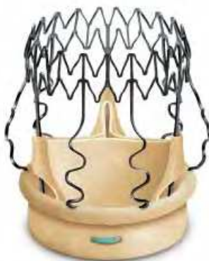
Perceval Sorin Valve