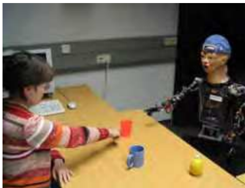
Figure 1. Imitation of deictic gestures for referencing on the same object

Many classical approaches developed so far for learning in a human-robot interaction setting have focussed on rather low level motor learning by imitation. Some doubts, however, have been casted on whether with this approach higher level functioning will be achieved (Gergeley, 2003). Higher level processes include, for example, the cognitive capability to assign meaning to actions in order to learn from the tutor. Such capabilities involve that an agent not only needs to be able to mimic the motoric movement of the action performed by the tutor. Rather, it understands the constraints, the means, and the goal(s) of an action in the course of its learning process. Further support for this hypothesis comes from parent-infant instructions where it has been observed that parents are very sensitive and adaptive tutors who modify their behaviour to the cognitive needs of their infant (Brand et al., 2002).