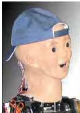
Figure 2. Child-sized Barthoc Junior

two serial connections to a desktop computer, and a motor for rotations around its main axis. One interface is used for controlling head and neck actuators, while the second one is connected to all components below the neck. The torso of the robot consists of a metal frame with a transparent cover to protect the inner elements. Within the torso all necessary electronics for movement are integrated. In total 41 actuators consisting of DC- and servo motors are used to control the robot. To achieve human-like facial expressions ten degrees of freedom are used in its face to control jaw, mouth angles, eyes, eyebrows and eyelids. The eyes are vertically aligned and horizontally controllable autonomously for object fixations. Each eye contains one FireWire colour video camera with a resolution of 640x480 pixels.