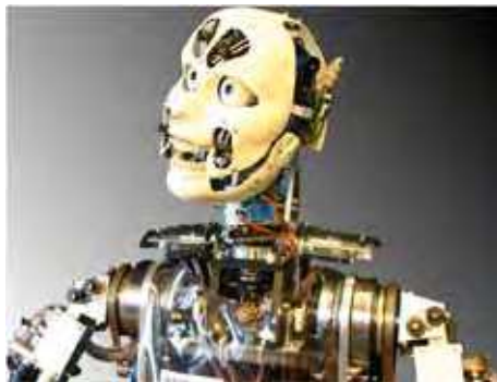
Figure 3. Adult-sized Barthoc

Besides facial expressions and eye movements the head can be turned, tilted to its side and slightly shifted forwards and backwards. The set of human-like motion capabilities is completed by two arms, mounted at the sides of the robot. With the help of two five finger hands both deictic gestures and simple grips are realizable. The fingers of each hand have only one bending actuator but are controllable autonomously and made of synthetic material to achieve minimal weight. Besides the neck two shoulder elements are added that can be lifted to simulate shrugging of the shoulders. For speech understanding and the detection of multiple speaker directions two microphones are used, one fixed on each shoulder element. This is a temporary solution. The microphones will be fixed at the ear positions as soon as an improved noise reduction for the head servos is available.