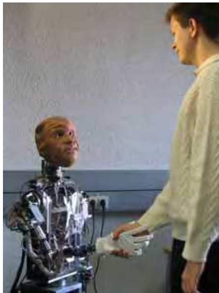
Figure 5. Scenario: Interacting with Barthoc in a human-like manner

The decision to which person Barthoc currently pays attention is taken by current user behaviour as observed by the robot. The system is capable of classifying whether someone is standing still or passing by, it can recognize the current gaze of a person by the face detector and the Voice Anchor provides the information whether a person is speaking. Assuming that people look at the communication partner they are talking to the following hierarchy was implemented: Of the lowest interest are people passing by independently of the remaining information. Persons who are looking at the robot are more interesting than persons looking away. Taking into account that the robot might not see all people as they are out of its field of view a detected voice raises the interest. The most interest is paid to a person who is standing in front of, talking towards and facing the robot. It is assumed that this person wants to start an interaction and the robot will not pay attention to another person as long as these three conditions are fulfilled. Given more than one Person on the same interest level the robot's attention will skip from one person to the next one after an adjustable time span, which is currently four to six seconds. The order for the changes is determined by the order in which the people were first recognized by Barthoc.