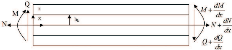
Fig. 1. Free body diagram of a differential beam element

Figure 1 shows a free body diagram of a differential beam element. Beams are considered as one dimensional (1D) load carriers and the main parameter for analysis of load carrier structures is stiffness.