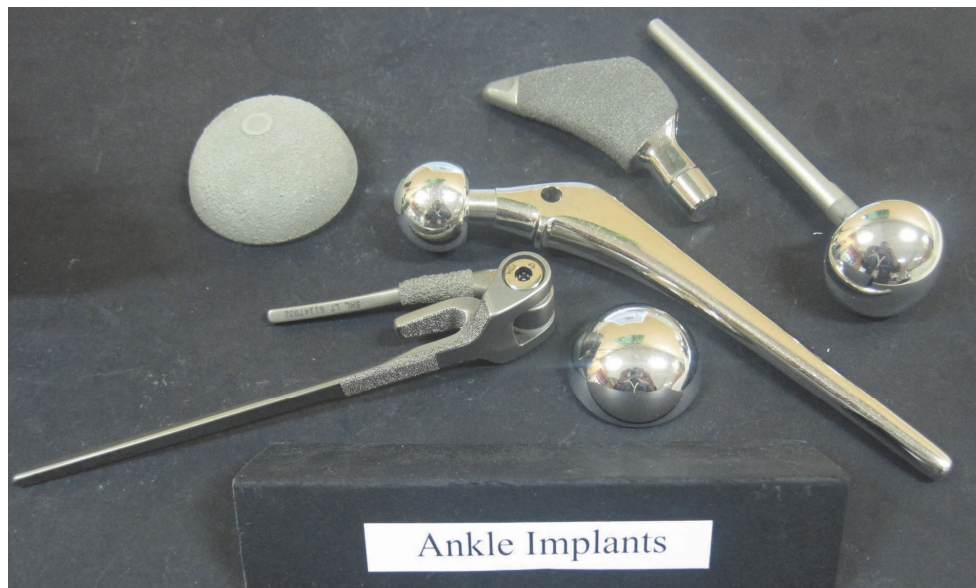
Fig. 1. A set of ankle implants (Courtesy of MediTeg, UTM).