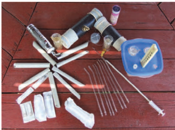
Fig. 2. The equipments and tools for artificial insemination

Based on the results of our survey (visiting the eleven farms), all necessary tools and equipments were available. Moreover, officially-accepted artificial insemination stations were operating on farms No. 1 and 7, from where semen could be bought by other farms.