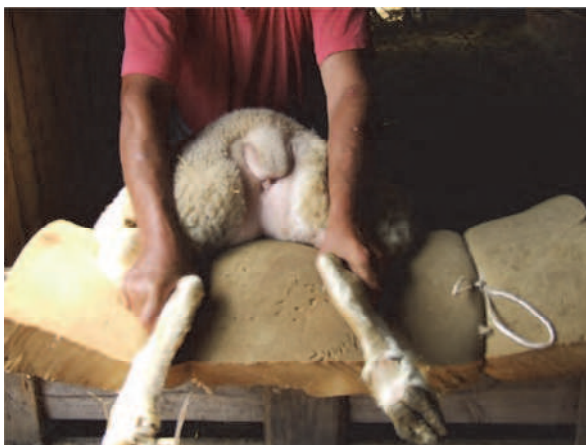
Fig. 3. The fixing of ewe for insemination

This operation needs more than one labourer, therefore, one catcher and one inseminator should be used for this job as a minimum. On most of the farms, the inseminations were performed by the owner shepherd with one or two labourers to help him. On farms No. 1 and 7, technicians conducted the inseminations. There was only one catcher helping the inseminator on farms No. 5, 7, 9, 10 and 11. Two labourers caught and held the ewes on four farms (No. 3, 4, 6 and 8). On the first farm, 5 catchers helped the work of 2 inseminators during the first three years, and in the following two years only one inseminator with two labourers performed the job. On farm No. 2, the number of catchers decreased from two to one during the last three years and only one inseminator worked there.