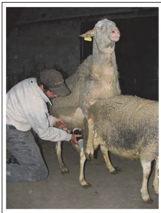
Fig. 1. Collection of semen at a farm

inseminations, 90 to 95% of pregnancy could be performed (Kukovics, 1974; Jávör et al., 2006; Gergátz, 2007).