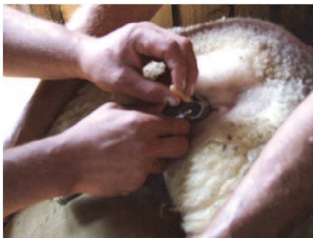
Fig. 4. The insemination

The commonly used method to reach and keep pregnancy at the highest possible level was the post-mating with entire rams that started one cycle after the AI and lasted for two cycles. Farm No. 4 was an exception, where no post-mating was utilised. An interesting thing happened in the case of farm No. 7, where post-mating was not used during the second four years of the studied period.