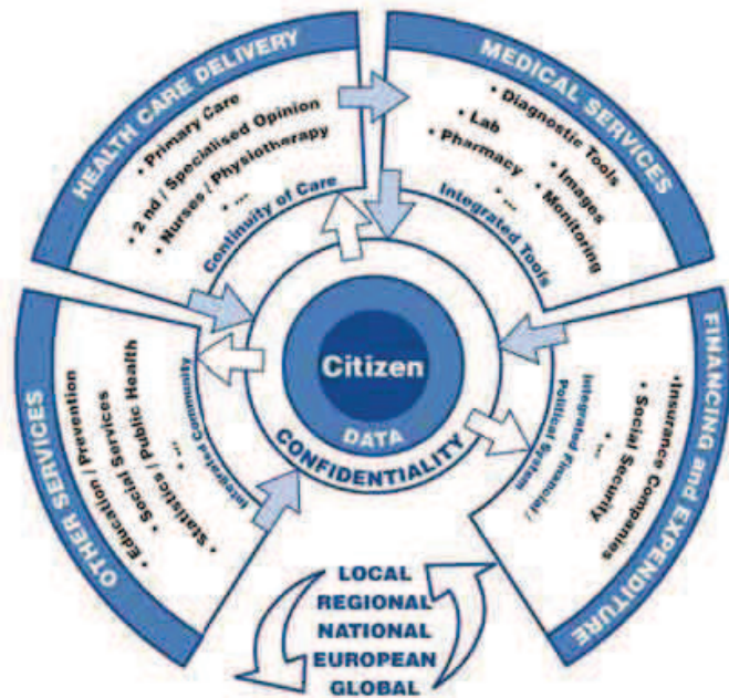
Fig. 2. The Vision For a Citizen-centered health care. Reproduced from: Telemedicine 2010: Visions for A Personal Medical Network-The Telemedicine Alliance-July 2004