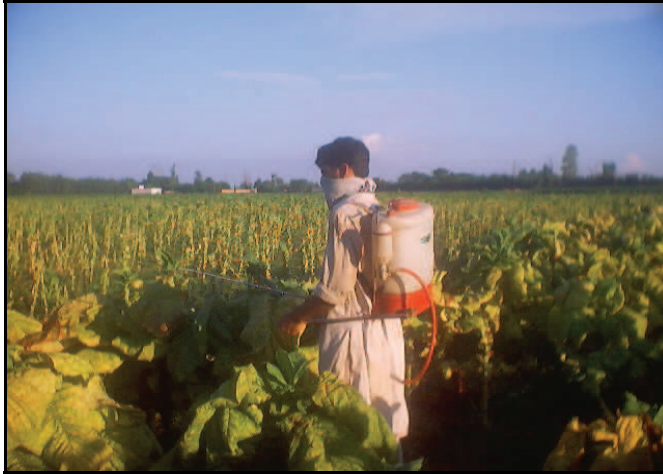
Fig. 3. Extensive pesticide usage