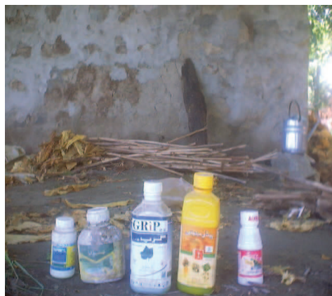
Fig. 5. Poor house keeping of pesticides