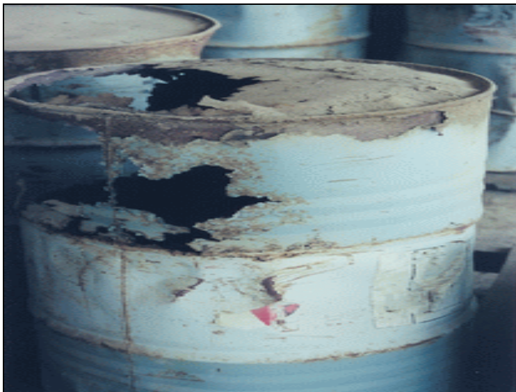
Fig. 2. Corroded pesticide container