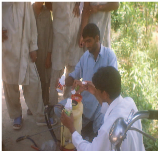
Fig. 4. Improper handling of pesticides