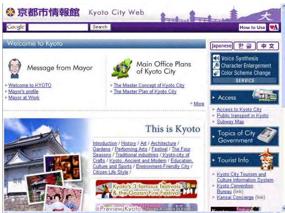
Fig. 1. Kyoto City Web site home

"To attract the world's cultures, Kyoto City created a Web site that allowed all people, regardless of their abilities or native language, to be able to access information. The Web site is available in four languages, and uses IBM Easy Web Browsing technology to enlarge text and read it aloud. The technology is very easy to use and is offered free to the user. Senior citizens, who often have vision difficulties such as low vision or cataracts, can now access all the information on the Kyoto City Web site through enlarged text or as a "screen reader." The screen size can be customized from 50% to 600%. It also enables the user to change the color of the Web site background to help those with color blindness and other color-related vision impairments. For children and non-Kyoto natives, the IBM Easy Web Browsing "reading aloud" function helps increase comprehension. Offering this enhanced communications functionality as part of its Web site increases the user's comfort level with technology – even for novice users."