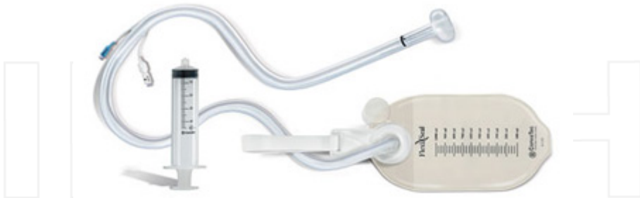
Figure 2. Fecal containment device [20].

Fecal containment device (FCD) prevents contact of perineal skin with fecal matter, reducing the risk for incontinence-associated dermatitis, pressure ulcer formation, fecal contamination of wounds and reduction in frequency of diaper, clothing, and linen changes [19].