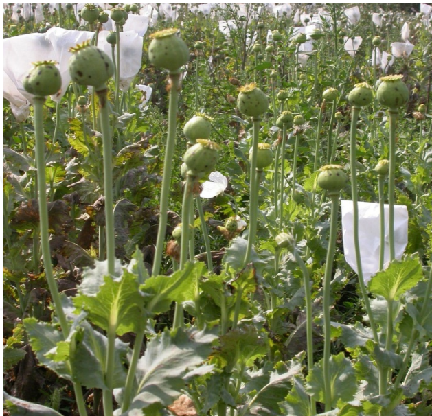
Figure 4. Field view of developed high thebaine lines.