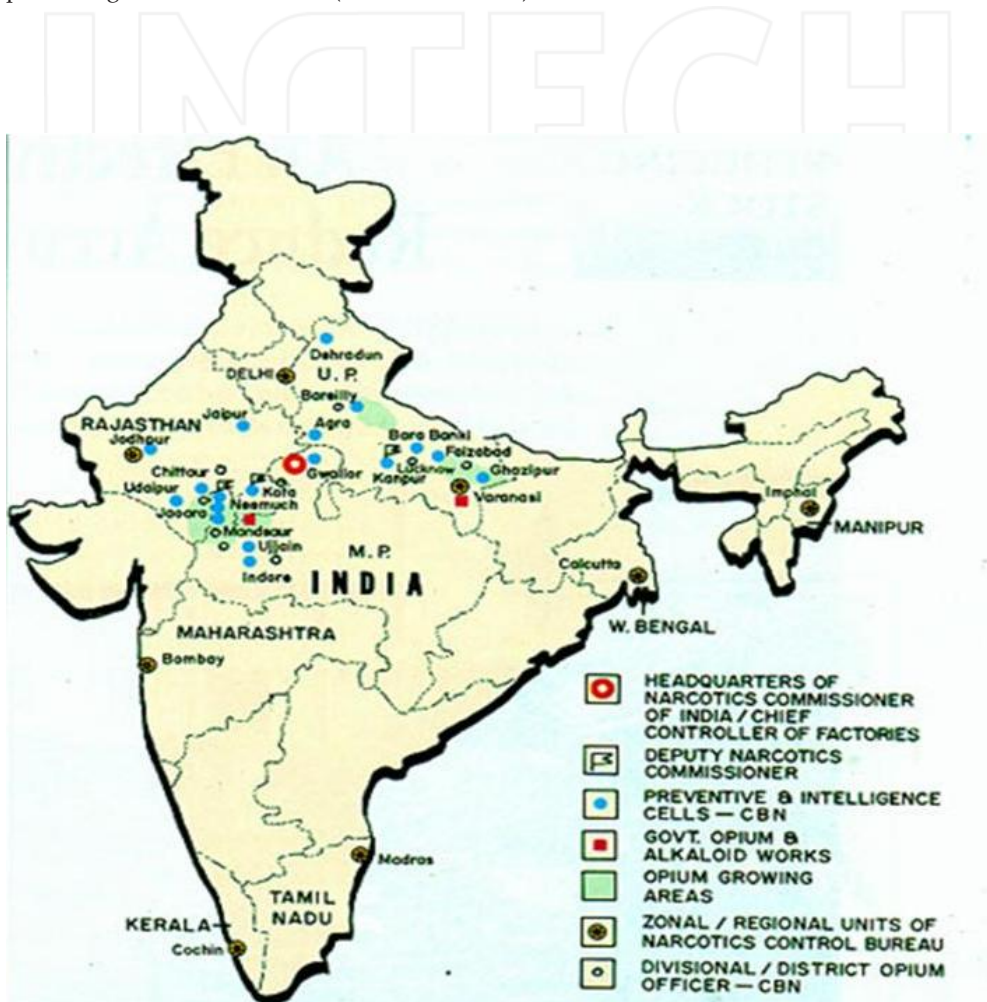
Figure 2. Opium cultivating areas in India and different offices of Narcotics Deptt.

Narcotics with its headquarter at Vienna, Austria. But at some places illegal cultivation is also being practiced which include Golden Crescent (Iran, Afghanistan and Pakistan) and Golden Triangle (Thailand, Burma, Myanmar). In Afghanistan, illegal cultivation of opium poppy to a large extent is the reason for very high drug trafficking compared with other illegal cultivating areas. Eleven other countries i.e. Australia, Austria, France, China, Hungary, the Netherlands, Poland, Slovenia, Spain, Turkey and Czech Republic also cultivate opium poppy, but they do not extract gum. They cut the bulb with 8" of the stalk (CPS system) for processing to extract alkaloids (Described earlier).