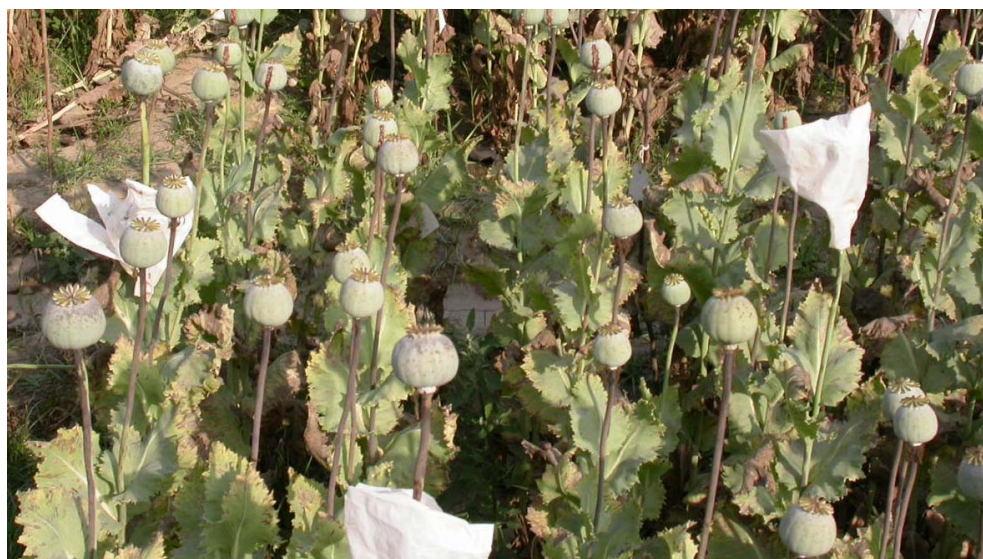
Figure 3. Field view of developed high yielding variety "Madakini".