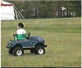
D. A two year old not paying attention to where he's going