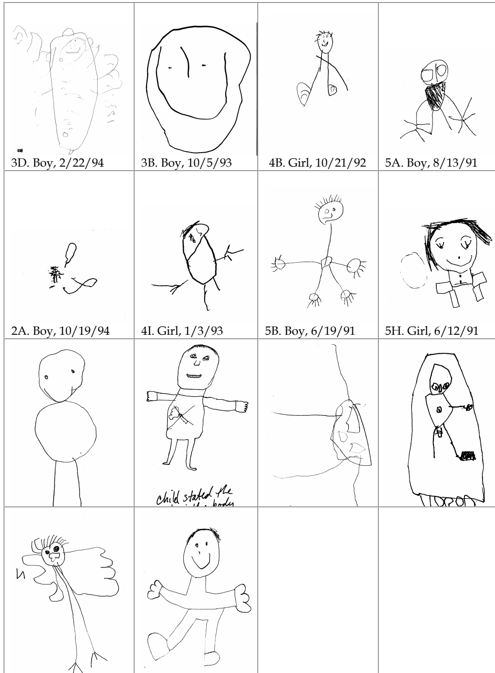
Fig. 5. Hand sketches used to confirm presence of sensory-motor capabilities.