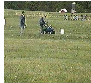
I. Instructions from the parent on how to use the throttle