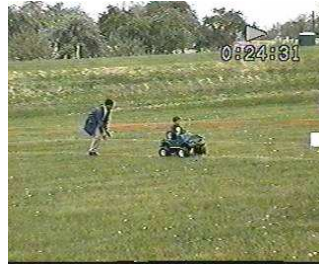
E. Steering off the lane with two wheels by a three-year-old