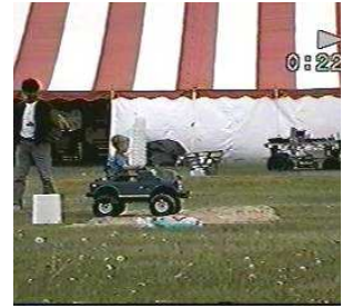
C. Overcoming a sand pit (increased resistance)