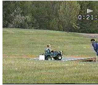
B. Maneuvering over a ramp (simulated bridge)