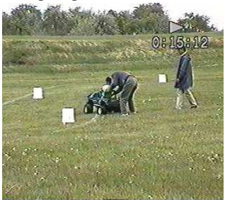
G. Steering out of bounds several times by the two-year-old