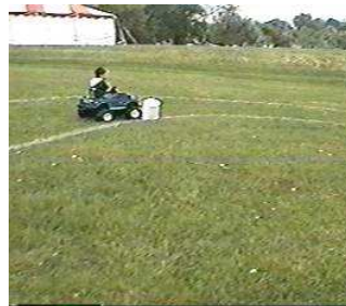
H. A three-year-old hitting an obstacle