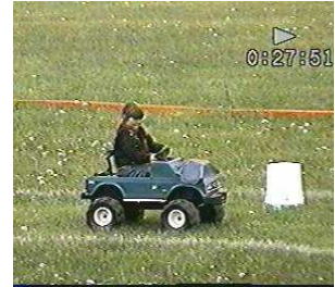
F. The challenge is intensive even for a four-year-old.