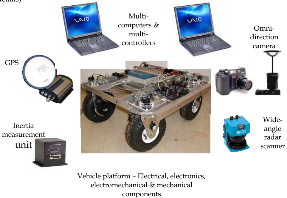
Fig. 2. Typical technology make-up of an IGVC vehicle.

Case Study B. Next consider an annual Intelligent Ground Vehicle Competition vehicles and its challenges. A typical technology make-up for an autonomous IGVC vehicle to implement intelligent control schemes is shown in Figure 2. (See www.igvc.org for more details)