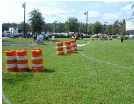
Fig. 3. Obstacle traps and lane for ACE.

The IGVC environments and goals consist of 1) Autonomous Challenge Event (ACE) where an agent must negotiate around an outdoor obstacle course in a prescribed time while staying within the 5 mph speed limit, and avoiding the random obstacles and escaping traps along the track (Figure 3), 2) Navigation Challenge Event (NCE) where agent autonomously travel from a starting point to a number of target destinations (waypoints or landmarks) and return to home base, given only a map showing the coordinates of those targets (Figure 4).