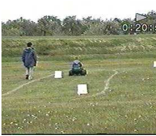
A. Staying inside the lane and avoid obstacles.