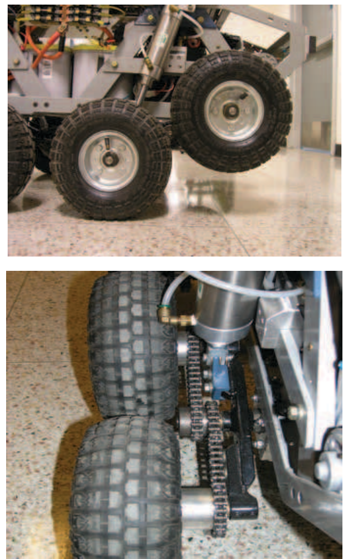
Fig.3.(a) Side View of Wheel Set (b) Top View of Wheel Set

WHEELMA uses soft rubber inflatable wheels. All eight wheels of the robot use economical 10-inch tires and hubs that rotate around a unique hub design attached to a rigid frame. Figure 2 shows WHEELMA with both wheel sets level as would be the case typically on a flat floored surface. Four internal motors effectively drive the wheels sets in both forward and reverse directions through appropriate speed reduction. The wheel-set rotation around a central axel delivers the articulation needed to conform to terrain contour. Figure 3(a) and 3(b) show the side and top profile of the wheel sets used on WHEELMA.