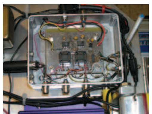
Fig.6. Video Multiplexer