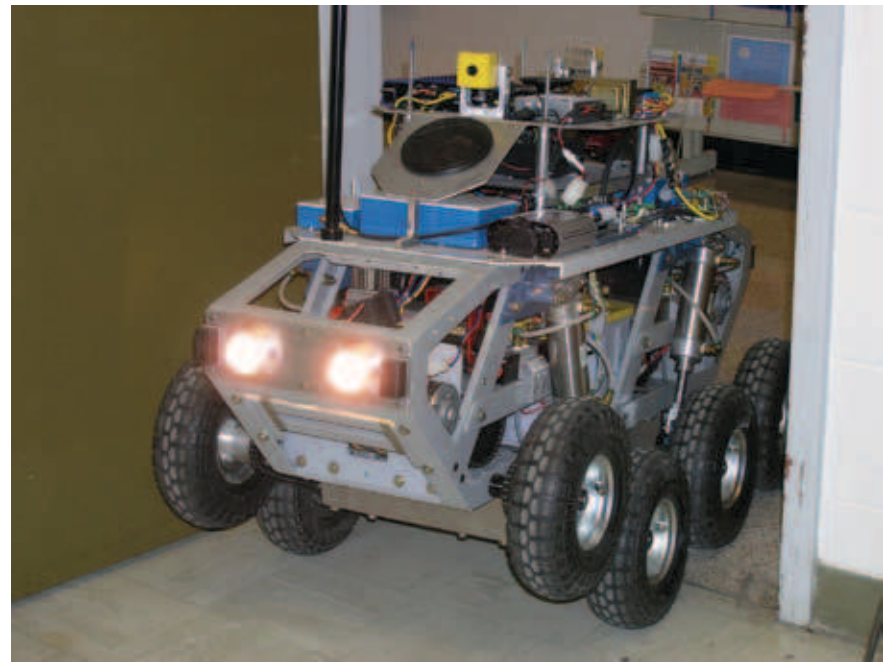
Fig.1. Wheelma Robot based on Eguchi system