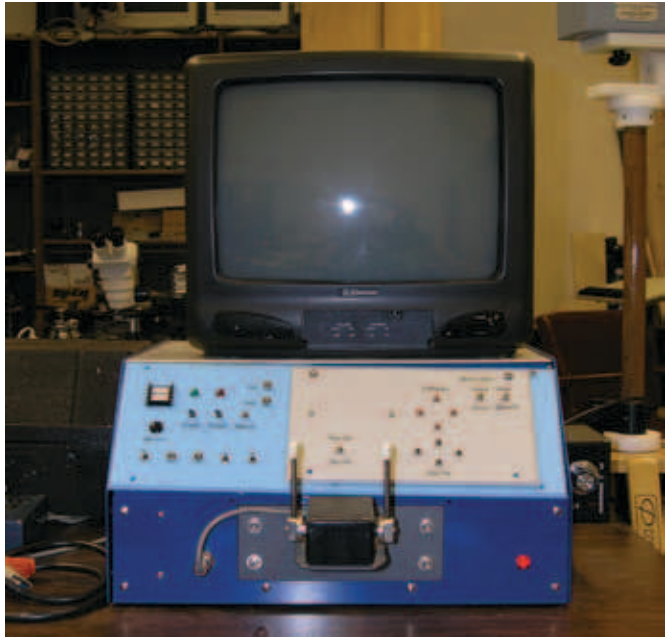
Fig.5. Controls Station