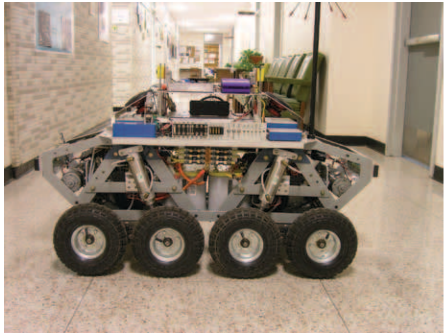
Fig.2. Wheelma Resting on Eight Wheels

A priority of the LSUS design was for it to be articulated so as to conform to un-level terrain as needed and continue to drive the robot in forward and reverse directions. Articulation requires a method of suspension with a certain amount of slack for the wheels to adjust to varying contours as they roll over terrain. Articulation combined with all-wheel drive has been used to handle rough terrain negotiation.