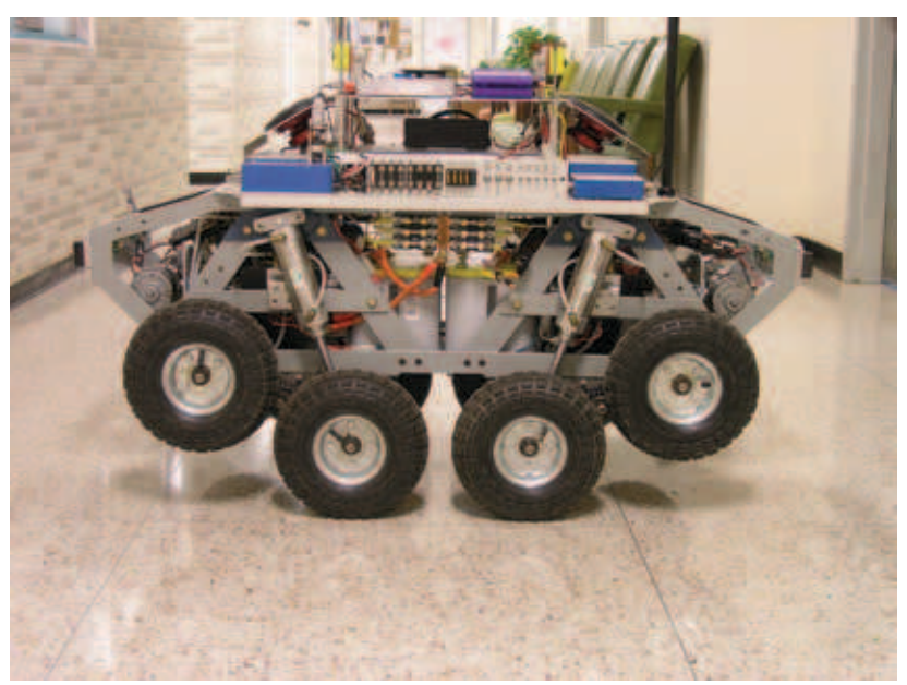
Fig.4. Wheelma Resting on Inner Wheels