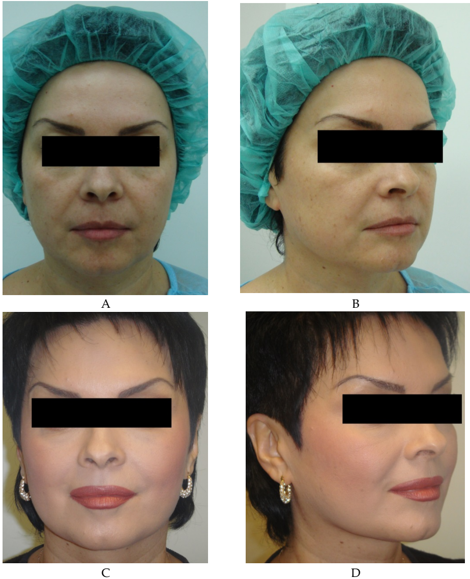
Figure 1. Patient N. 49 years old. Photo (A;B.) Before threads plantation. Photo (C;D.) Here is a correction of the middle third and lower third of the face. 1 month later.

Patients with atonic, rugulose skin with manifestations of photoaging can also improve their appearance using this method. L.L. Elegance works perfectly in combination with hyaluronic acid fillers, peelings, and botulinum toxin.