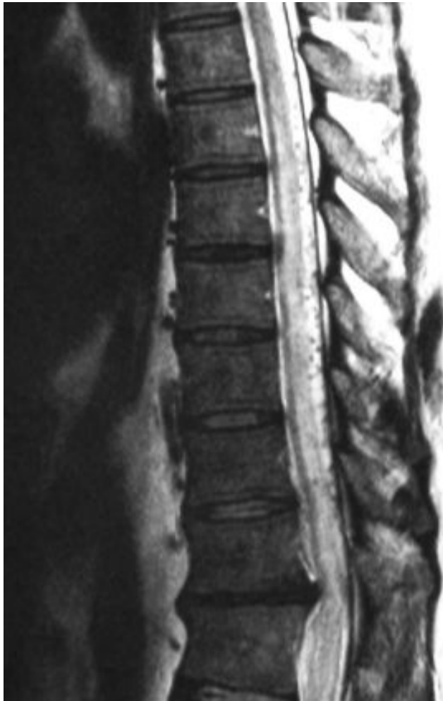
Figure 3. T2 Sagittal MRI showing hyperintensity within the spinal cord indicating edema

MR Imaging is often the initial image modality used to diagnose ventral intradural AVFs. Like their dorsal counterparts, T2 prolongation in the parenchyma may be noted with flow voids on the ventral aspect of the cord or thecal sac. However, it is difficult to determine the type of AVF or differentiate between the subtypes of ventral AVFs and spinal angiography remains the standard for diagnosis. (Figure 3)