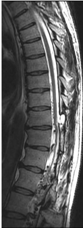
Figure 7. T2 Sagittal MRI showing tortuous vessels at the level of the conus in a male presenting with severe cauda equina syndrome.