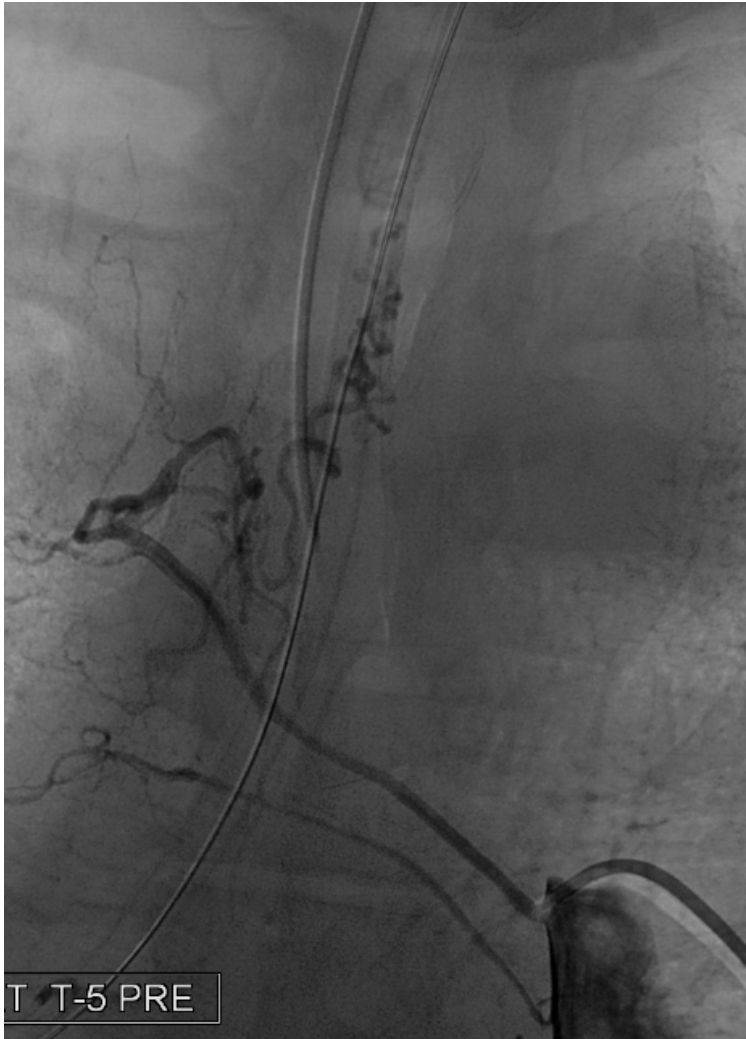
Figure 2. Spinal angiogram showing a dorsal intradural SDAVF filling from the right at T5

Even with the advances in MR imaging and angiography, catheter angiography remains the gold standard for diagnosis of dorsal intradural AVFs. It also provides an opportunity for possible endovascular treatment (discussed below). SSA reveals tortuous dilated vessels that may span many levels and also the characteristic slow-flow pattern produced by the feeding dorsal radiculomeningeal artery (Figure 2).