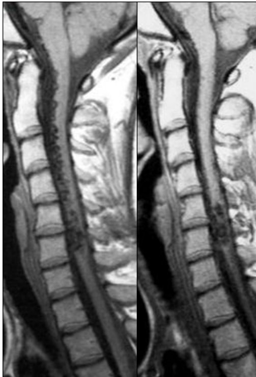
Figure 5. T1 Sagittal MRI showing serpentine “low signal” within the parenchyma of the cervical spinal cord

these lesions. MR features suggestive of vascular malformations include a serpentine pattern of low signal on T1 and T2WI (flow in dilated tortuous vessels of the arterialized coronal venous plexus), scalloped appearance on T1WI (Arterialized pial veins may focally indent the cord surface) and spinal cord signal changes due to venous congestion, myelomalacia, infarction and hemorrhage. MRA is increasingly being used for the diagnosis, localization and characterization of spinal AVMs. Mull et al reported identification of the feeding artery in 10 out of 11 patients with intradural spinal AVMs [8]. The limitations of MRA are difficulty in detection of multiple feeding vessels, low sensitivity for detection of spinal aneurysms, and inability to offer therapy in the same sitting. (Figure 5)