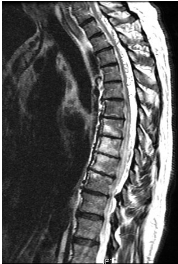
Figure 1. T2 Sagittal MRI showing tortuous vasculature on the dorsal aspect of the spinal cord and signal change within the cord representing edema.

MRI is the initial image modality used in the evaluation of suspected dorsal intradural AVFs. MRI often reveals increased signal intensity at the center of the cord on T2-weighted images which corresponds to cord edema and which may span several levels. Dorsal intradural flow voids may be present and are more evident on T2-weighted images or contrast-enhanced T1-weighted images. With the advancement in MRI technology, MRA can more reliably identify the location of the fistula though spinal angiography remains the gold standard [8, 25]. (Figure 1)