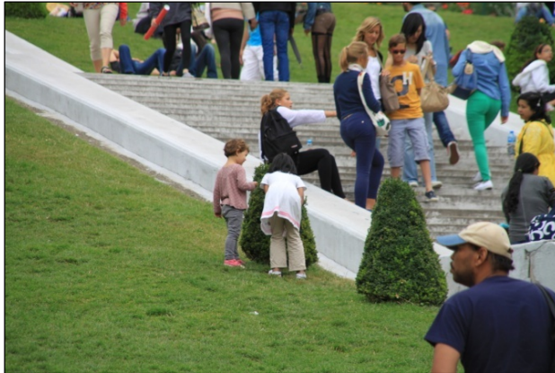
Figure 13. Plants are interesting materials for children

Children would like to see plants that can be used for play. For this purpose, plants can also be used to serve a variety of outdoor activities in open spaces designed for children. Trees, shrubs, flowers, vegetables and parts of these plants, such as branches, leaves, pinecones are important elements of children's environments and plays (figure 13, 14, 15). Plants in child environments are used with the objectives of enclosure, identity, movement, climbing, play props, programmed activities/education, accessibility/integration, landmarks, seasonal change, wildlife enhancement, climate modification, and environmental quality (Moore, 2002). Plants offer different color options in different seasons with their colorful leaves, flowers and fruits. Results of the author's master thesis that focused on the plant preferences for children play spaces revealed that children like red, yellow, mottled, blue and orange colored leaves while they do not like yellow and green colored leaves. Study also revealed that purple, pink and white flowers were favorite, while red and white colors were unfavourable. In terms of fruit color, study also found that red and blue were favorite, while yellow and orange colors were unfavourable (Acar, 2003).