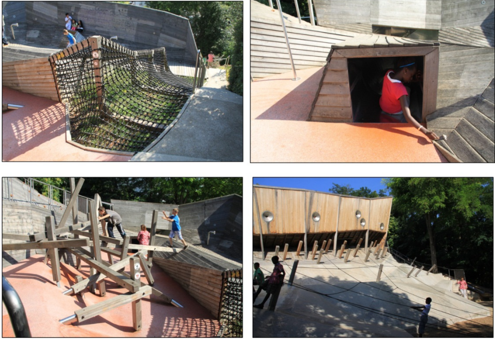
Figure 23. Play space from Paris, France