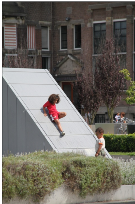
Figure 1. Sloping surfaces in any area are used to slide by children.