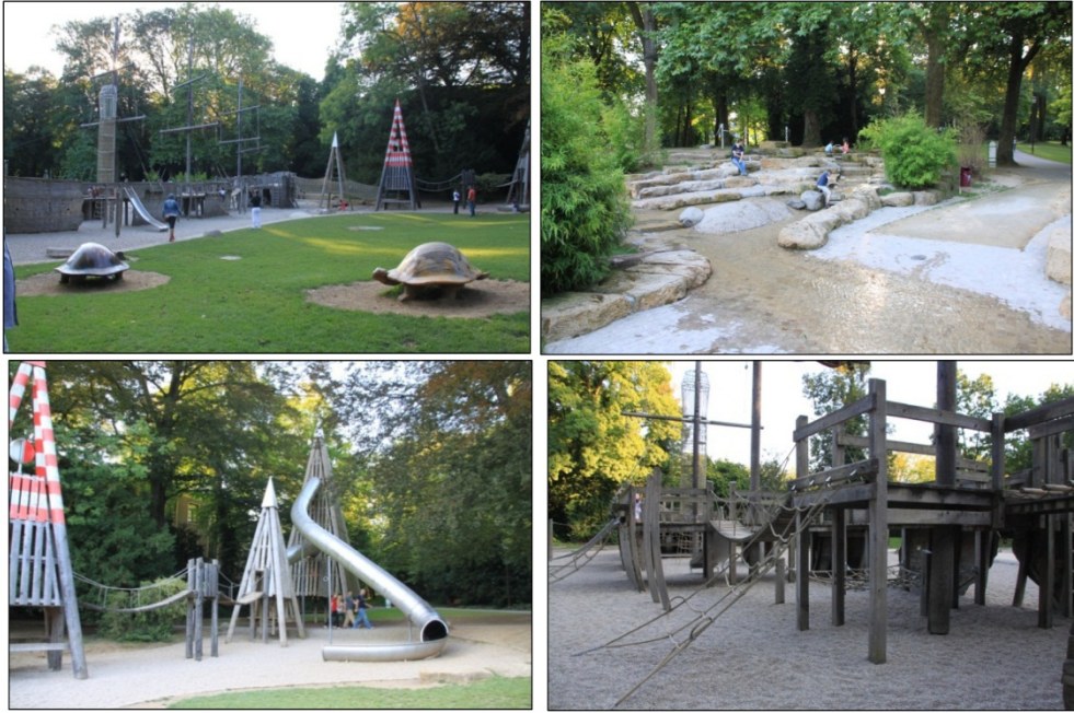
Figure 18. Figure 18. Play space from Luxembourg, Luxembourg