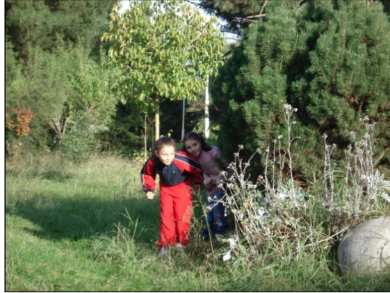
Figure 14. Figure 14. Plants are ideal materials to hide behind

(Moore, 2002). In addition, care must be taken for children's health and safety according to selected species (allergens, toxic, barbed should not be used).