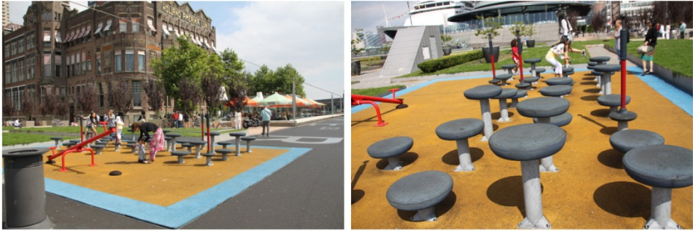
Figure 16. Play space from Rotterdam, Netherland