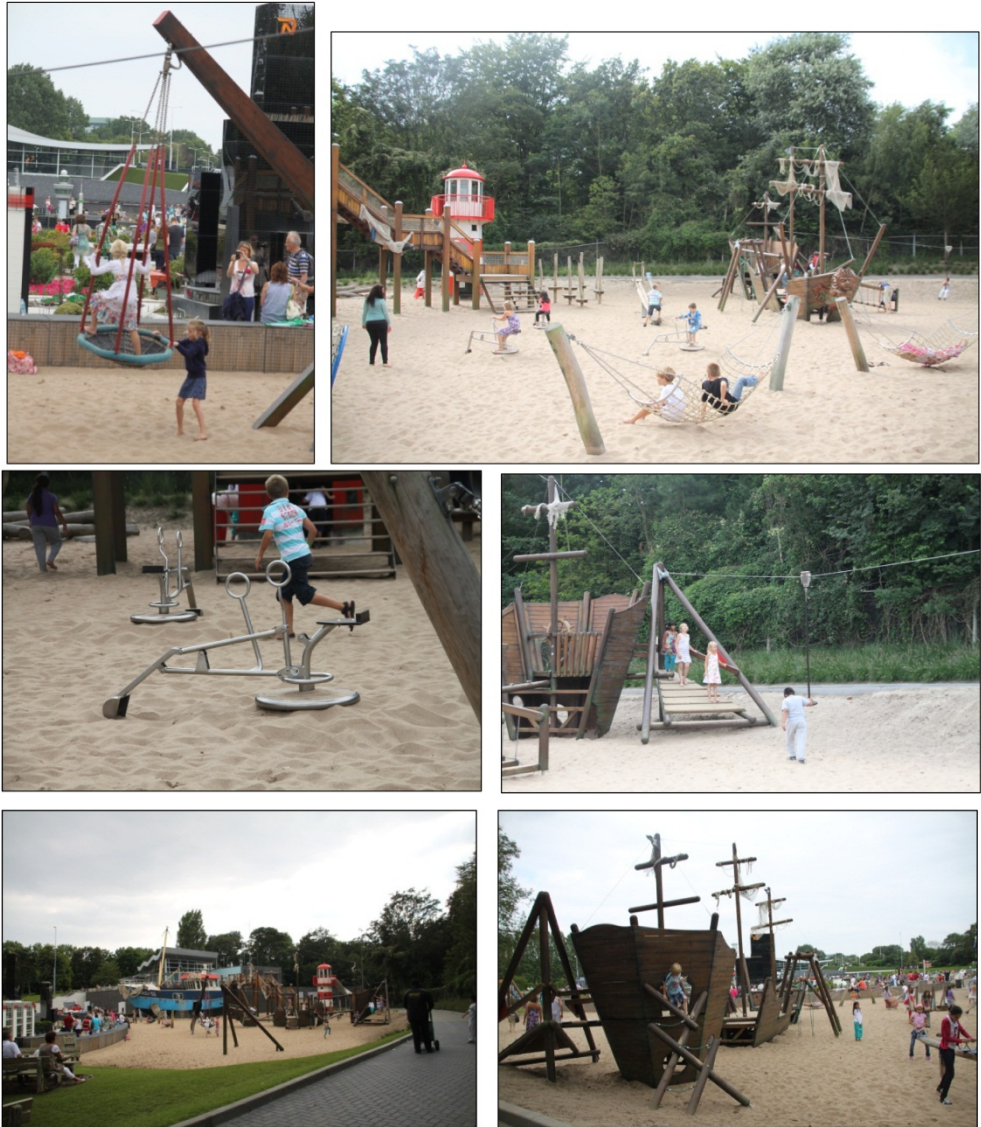
Figure 20. Play space from Den Haag, Netherland