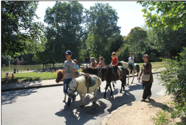
Figure 7. An activity allowing direct contact with nature- pony ride on the area-

"Study nature, love nature, stay close to nature. It will never fail you" Frank Lloyd Wright (Tai et al., 2006). This expression of Wright explicitly refers to the result of being in relationship with nature.