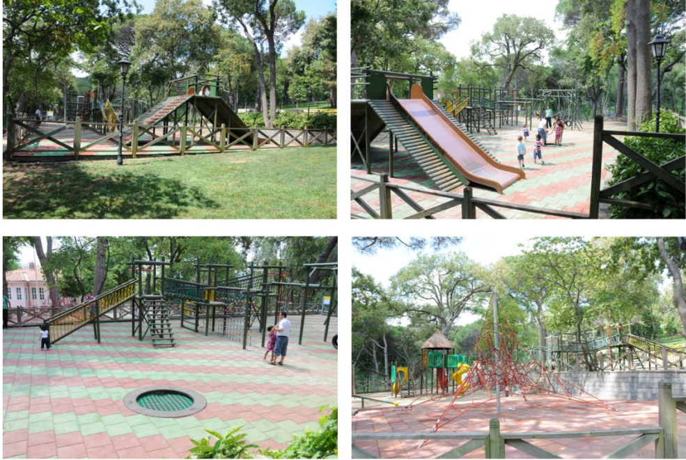
Figure 21. Play space from Istanbul, Turkey