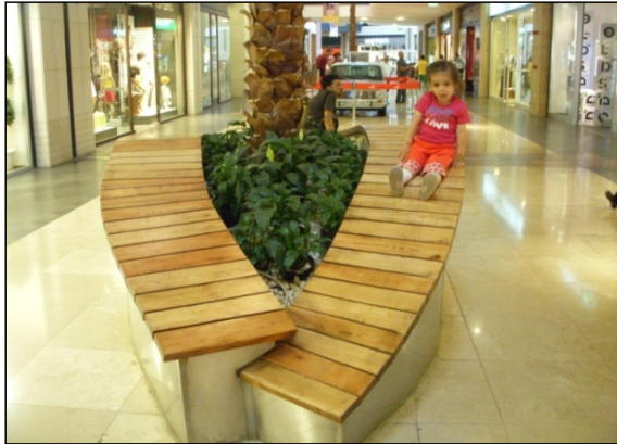
Figure 9. Figure 9. A curved equipment designed by adults for aesthetically or sitting in the shopping center can be play element to slide for a child

For example, while adults enjoy looking at a lake, trees, the grass, these must be a tactile auditory, oral and olfactory experience for children. "It is through body contact, direct and often disorderly, that need to experience their world". Puddles of water that adults avoid are funny places splashing when pressed for children. Lush green hills adults likes looking at is a place to roll down, feel the wet soft grass, smell its green smell for a child, an experience the free fall of tumbling round and round. Adults prefer visually clean and well maintained places instead of irregular and wet grass in open spaces. However, children as one of the players that use the environment are "place-messers" (Francis, M. 1997).