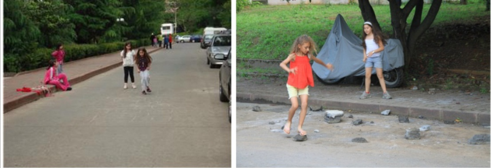
Figure 10. Streets are play spaces for children near their home (Photos Acar, H., Trabzon, Turkey)

both sexes and all age groups. However, streets are thought as a transportation routes used to go from a point to b point or parking areas for vehicles by adults (Moore, 1991).