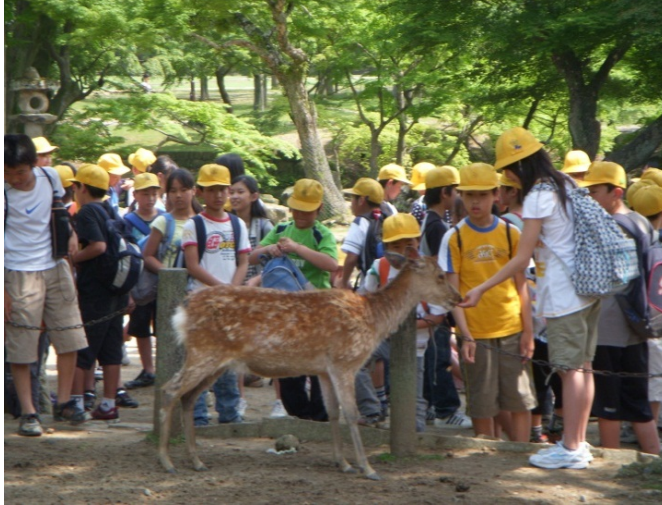
Figure 12. Figure 12. The opportunity of interaction with animals allows children to have information about the animals (Photo Acar, H., Nara, Japan)

Girls are often pay attention to the aesthetics of the environment and like colorful and beautiful flowers. Girls particularly 13-15 aged ones, have a variety of definition about the space when compared to boys (Day and Midbjer, 2007). It is observed, that girls prefer, for example, flowers and butterflies and trees, whereas boys prefer more active play such as sliding and playing hide and seek. However, they all need quite places to rest, talk, and socialize (Simonic et al., 2005).