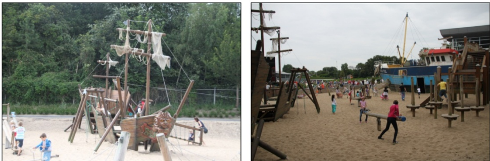
Figure 19. Figure 19. Play space from Den Haag, Netherland

There is also a ship figure in this play space. In addition, there are different equipment for different activities such as swinging, sliding, balancing, jumping, and playing with sand. Seating areas were also designed around the playground for parents together with the children (figure 19, 20).