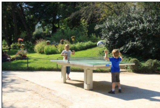
Figure 4. Children use materials in the environments according to their own purposes.

Children use these opportunities according to their own imagination, creativity, or purposes (figure 4).