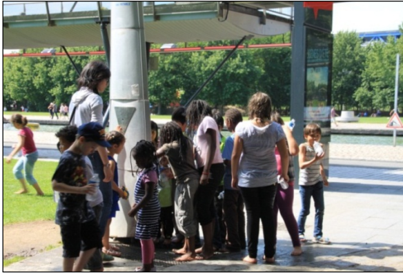
Figure 6. Even a fountain allows children come together, to communicate, to socialize. At the same time helps them to learn issues such as to respect the rights of others and their right to self-defense (Photo Acar, H., Paris, France).