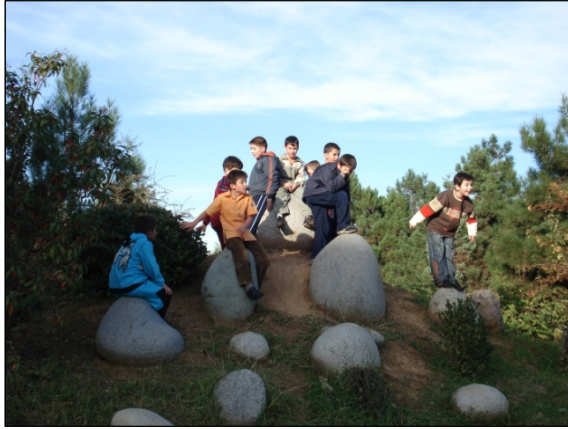
Figure 8. Figure 8. A rock garden and rocks in the garden designed aesthetically for adults are elements seating, climbing, over and around the watch for children