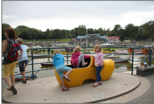
Figure 2. Any object that children can enter might be a play space for them (Photo Acar, H., Den Haag, Netherland).