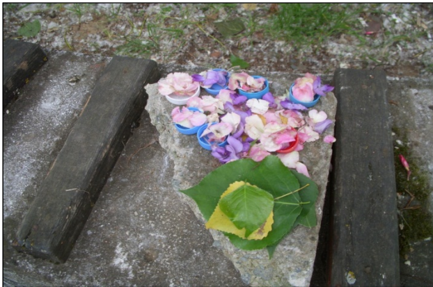
Figure 15. Figure 15. Plant parts are important play materials

Finally, White and Stoecklin (1998), cited the following features that children likes to see in public areas;