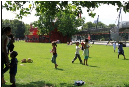
Figure 3. Open green spaces provide opportunities for different activities (Photo Acar, H., Paris, France).

Children use these opportunities according to their own imagination, creativity, or purposes (figure 4).