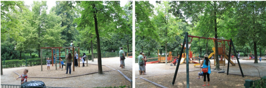
Figure 17. Figure 17. Play space from Brussels, Belgium

This area was designed in woodland in the city. It is particularly suitable for disabled people with ramp play equipment. It provides an opportunity to contact with nature for children as it is in a woodland area (figure 17).