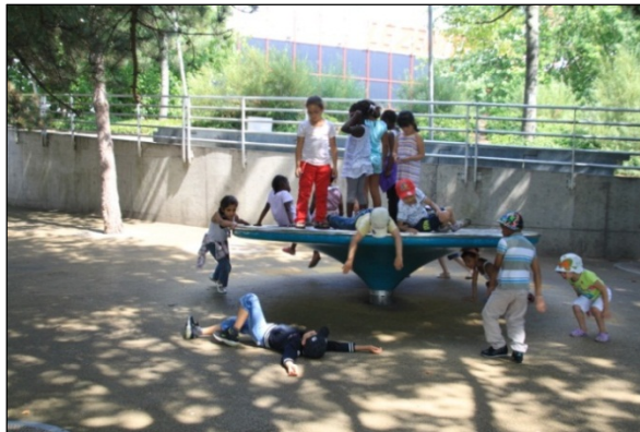
Figure 5. Open spaces provide the opportunity to be together with other children.

Open spaces provide more opportunity than the closed spaces with the materials they have (Heerwagen and Orians, 2002; Day and Midbjer, 2007; Acar, 2009). First of all, these spaces experimentally allow children to contact with their environment, to make observation and to learn natural events (change of the seasons and so on). Also, it helps children to become social because it presents the opportunity of being together with other children (figure 5, 6).