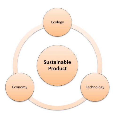
Figure 12. Three elements to support the sustainable product.

to have a lot of bamboo material resources and ecosystem [92]. Bamboo has roots that spread underground in all directions; land turned into solid and protects us from landslides and earthquakes by heavy rains. This means that the stand of bamboo should be treated as common ground for the public community. Economic trade market incomes only concern about the cost of production, otherwise cost disposable products used completely overlooked. This is one of the main reasons why the serious problem of waste disposal and environmental disruption has been caused recently.