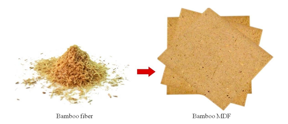
Figure 4. Bamboo Medium Density Fibreboard (MDF) from bamboo fibre.

bamboo which is non-wood species would provide profitable and marketable panel products in Thailand. Therefore, such panels are not only environmentally friendly but also alternative ways convert under-utilized species into substrate panel products for furniture manufacture.