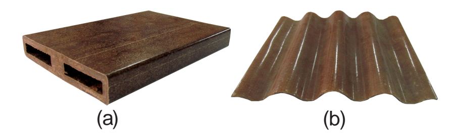
Figure 8. Profiling (a) and roof (b) made from bamboo composites reinforcement thermoplastic.