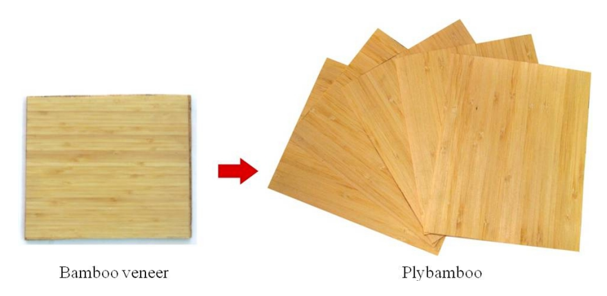
Figure 3. Plybamboo from bamboo veneer

publication reports the mechanical properties evaluation of 5-layered bamboo epoxy laminates [21]. Therefore, the purpose of the present research was to manufacture five types of laminated bamboo flooring (LBF) made from moso bamboo (P. edulis) laminae and investigate their physical (dimensional stability) and mechanical properties (bending properties) by ultrasonic wave techniques and a static bending method [22].