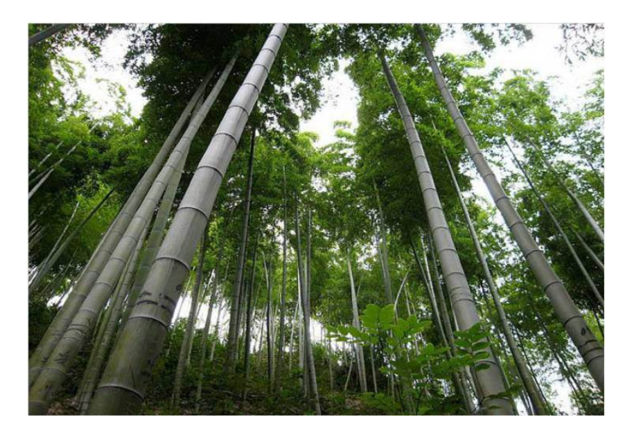
Figure 1. Bamboo plantations in China [10].