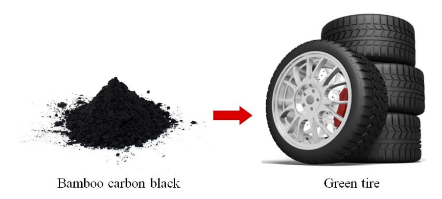
Figure 10. Green tire made from bamboo carbon black.

for obtaining improved initial modulus and durability [44]. Carbon black mainly used as a reinforcing filler in tires starting from 20th century produced a 10-fold increase in the service life of tires. Apart from various types of natural fibres, bamboo also can be burned in furnace for certain temperature and heat to be synthesized into carbon black formed [45]. Since then, carbon black has remained established the major reinforcing material for use in tires as well as other rubber products. Generally, incorporation of carbon-black comprises about ~30% of most rubber compounds. As people playing more and more attention to environmental protection, therefore utilization of various natural fibres especially bamboo as filler as replacement of burned fossil fuels in natural rubber polymer matrix creates greener tires produced, as shows in Figure 10. In addition, physical and mechanical properties of tires manufactured were enhanced with very satisfactory levels in terms of abrasion resistance and improved a lot of resistance to tread. Thus, exploitation of bamboo was no doubt creates improvement in development of elastomer biocomposites.