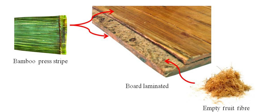
Figure 5. Crushed bamboo stripes laminated with empty fruit fiber.