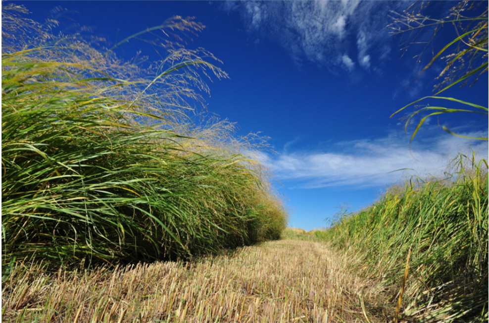
Switchgrass plot following the 2011 harvest at Central Grasslands Research Extension Center, Streeter, ND.

and there are no concerns about the invasiveness; (4) there are many environmental benefits for growing switchgrass.