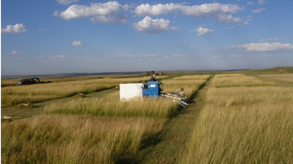
Harvesting perennial grasses plots in fall 2007, Streeter, ND.