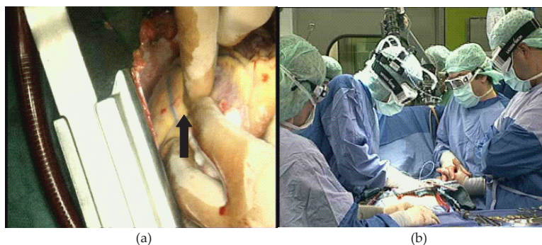
Figure 2. Intraoperative mapping with a small fingerprobe (a) and laser photocoagulation with protective goggles (b)

If no aneurysm is present, the ventricle is generally not opened but mapping guided laser photocoagulation only performed epicardially. If in these cases no further epicardial focus can be mapped but a VT, mostly different to the initial clinical recording, is still inducible, the procedure must be terminated without complete cure, as already described above. According to our very strict protocol, all these patients receive an ICD in a second intervention.