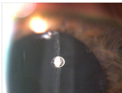
Fig. 2. Intraocular ointment drop in the anterior chamber

Even though TASS is defined as an acute inflammation, it is not rare to find TASS delayed days after surgery. It is usually caused by intraocular lenses (chemicals used in packaging, polishing, cleaning or sterilization of the lens) or even ocular ointments (Figure 2). An outbreak was reported by Werner when ocular ointment containing petroleum was associated to tight ocular postoperative patching (Werner et al., 2006).