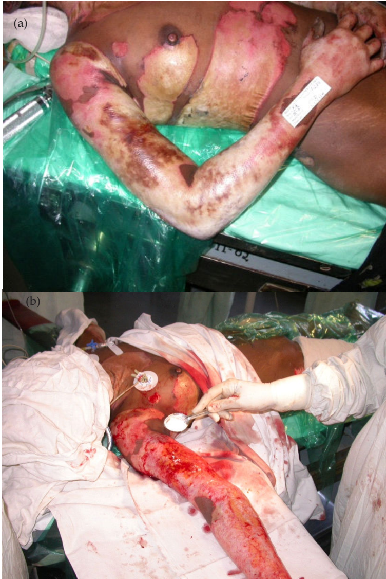
Figure 1. Showing Wound bed preparation. A : Burn wound before early excision; B: Sprinkling of Chloramphenicol powder after adequate excision of burn wound

The data was analyzed at the end of study period.