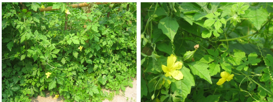
Figure 1. Flowers, immature fruit and young leaves of Momordica charantia (MC) at a home garden in Chiang Mai, Thailand (the picture was taken in March, 2012).

MC is an herbaceous, tendril-bearing vine growing up to 5 m in length. It bears simple, alternate leaves, with 3-7 deeply separated lobes. Each plant bears separate yellow male and female flowers [12]. Fruit 2.5-25 cm long, oblong, pendulous, fusiform, usually pointed or beaked, ribbed and bearing numerous triangular tubercles, 3 valves are present at the apex when mature. MC are perennial climbers cultivated throughout India and in Southern China and is now found naturalized in almost all tropical and subtropical regions. It is an important vegetable in India, Sri Lanka, Vietnam, Thailand, Malaysia, the Philippines and Southern China. It is also cultivated on a small scale in tropical America. MC is grown mainly for the production of immature fruit, although the young leaves are edible as a vegetable [3]. The young fruit is emerald green, but turns to orange-yellow when ripe. At maturity, the fruit splits into irregular valves that curl backwards and release numerous brown or white seeds encased in scarlet arils (Figure 1). All parts of the plant, including the fruit, taste bitter. It has been used extensively in traditional medicine as a remedy for diabetes.