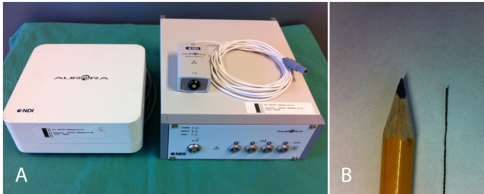
Figure 2. A) Electromagnetic tracking system - NDI Aurora. (B) Tracking sensor – 0.5 mm diameter

However, electromagnetic tracking systems are sensitive to disturbances created by metallic objects and electromagnetic noise. For Endovascular applications this is specially challenging since the X-ray/fluoroscopy imaging equipment represents a substantial dynamic disturbance (Bø et al., 2012). To make navigation feasible in these cases either the disturbing equipment (i.e. X-ray equipment) must be moved to a safe distance during navigation or a correction scheme must be applied. Several methods for compensating the disturbances have been reported in literature. The most common approach is to sample reference points throughout the tracking volume. The same points are sampled with and without disturbances present and this is used to map the deformation field caused by the disturbance (Kindratenko, 2000).