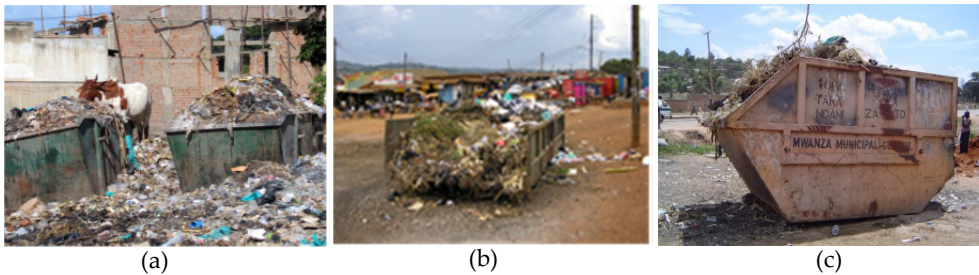
Figure 2. (A) Skip amidst wastes in Lira, Uganda(2006) (B) community managed skip at a collection point in Kamwokya, Kampala Uganda (2005) (C) A skip in Mwanza, Tanzania

The generated wastes are transported to transfer points (Skips, bunkers, standby trailers, open lots see Figs 2 and 3 mostly by the waste generators (e.g. households, commercial premises, market traders) themselves or hired (informal) labour, before collection by urban council workers or private operators. Industries, large institutions (e.g. educational, hospitals), shopping malls, large markets have their own transfer stations served by skips, bunkers, trailers and other waste containment facilities.