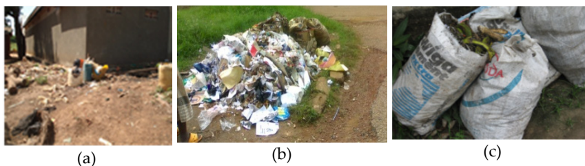
Figure 1. Waste containers disposed with wastes (A)- plastic jerry cans in in Soroti, Uganda (B) – sacks, plastic bags and cardboard boxes disposed with waste in Kampala, Uganda (C)- wastes in plastic bags in Dar es Salaam Tanzania.

Household wastes are stored in bins by the affluent and in sacks, plastic bags, cut jerry cans, cardboard boxes by the low-income households, and a large percentage of domestic waste storage containers (e.g. sacks, polythene bags and boxes) used by the poorer urban community are dumped with the wastes (Figure 1). There is no sorting as such, but households separate components of wastes considered of value such as vegetables and food leftover ( for animal feeds – used at source or sold, sometimes given free ), plastic bags ( reuse ), bottles- plastic/glass ( reuse and sale ), tins ( reuse and sale ) and scrap metals ( for sale ) are separated by some households from waste that is usually stored mixed. Sorted/separated wastes are either reutilised at source or sold to itinerant buyers who afterwards sell them to middlemen who supply recycling industries. Waste separation also takes place at transfer stations (e.g. bunkers, skips, road verges,) on transit to the landfill and at the landfill or dump sites.