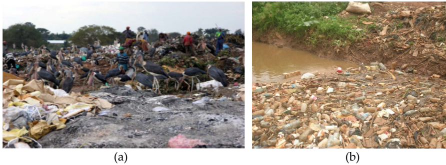
Figure 7. Waste disposal: (A) - The Kitezi landfill in Kampala where waste pickers can be seen at work (B) – the impact of indiscriminate disposal on Nakivubo channel, Kampala (wastes washed from the catchment floating on storm water).

through formalisation of operation conflicts with formal collectors ensues especially regarding areas of operation. Achankeng (2003) reports such conflicts in Cameroon and quotes Kamel (2001) for such conflicts in Cairo. Such conflicts however could be avoided if urban councils formalise all waste operation activities and set clear rules of operation whereby zones of operation and all other requirements are strictly adhered to. This is only possible for waste pickers if organised in formal groups that can be legally registered, monitored and supervised as reported in studies by Mbeng et al. , (2009) in Cameroon and Nzeadibe (2009) in Nigeria.