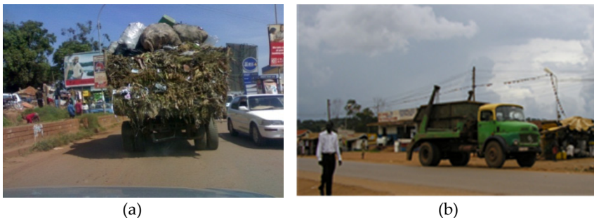
Figure 5. Waste transport: (A) - overloaded open truck (the sacks contain sorted plastics) in Kampala, Uganda and (B) - a skip conveying truck in Kampala Uganda

Institutions like universities, schools, hospitals and business complexes are often served by the private companies, while those not served transport their wastes individually to community collection points. The urban poor receive very low to no waste collection services due to inaccessible roads, unplanned facilities and neglect by the urban councils. Waste collection in East African urban centres is not based on the total amount of waste generated but rather on the level of income of the service area (Kaseva & Mbuligwe 2005; Okot-Okumu & Nyenje 2011). Satisfaction level for waste collection is higher for private operators compared with the urban councils. This can be attributed to the low waste collection frequency causing nuisance to communities. In most urban areas only a small fraction of the wastes generated daily is collected and safely disposed. For example in the cities 45% (Rotich et al. , 2006), 43% (Okot-Okumu 2008; Okot-Okumu & Nyenje 2011) and 30% (Oberlin, 2011) are collected for Nairobi, Kampala and Dar es Salaam respectively. Collection of solid wastes is usually concentrated in the city centres and high income neighbourhoods and even then these are irregular. Common collection and transport modes are covered compressor trucks, open trucks and trailers. Wastes on transit are often uncovered causing littering, odour and aesthetics problems (Fig 5).