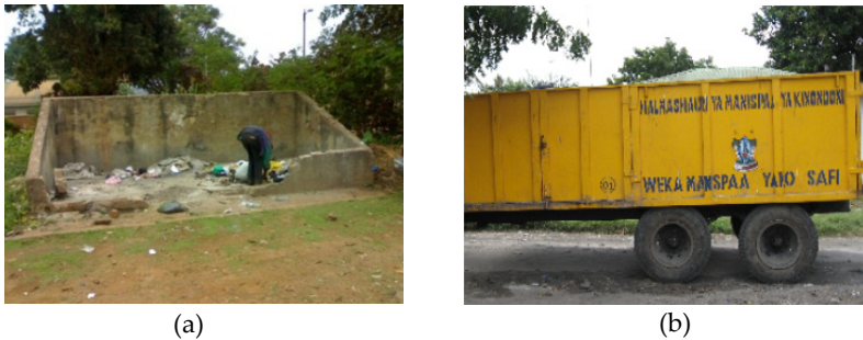
Figure 3. Waste transfer points/methods: (A) -A bunker in Makerere, Kampala Uganda ((photos by author, 2009); (B) - a tractor trailer in Dar es Salaam, Tanzania (source: Simon, 2007)