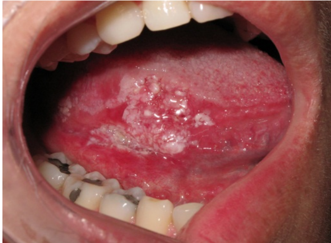
Figure 1. Squamous cell cancer of the posterior lateral border of the tongue in a 28-year-old woman. She smoked a cigarette per day for 15 years.

highest frequency (Figure 3). Since oral squamous cell carcinoma (OSCC) is the main malignant neoplasia we focus in it.