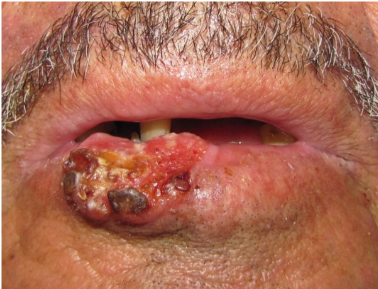
Figure 3. Squamous cell cancer of the lip in a 74-year-old man. He was a farmer and consumed alcohol chronically.

There are premalignant lesions recognized like: leukoplakia, erythroplakia, oralsubmucosal fibrosis, palatal lesions of reverse cigar smoking, oral liken planus, discoid lupus erythematosus, and hereditary disorders like congenital dyskeratosis and epidermolysis bullosa, but beyond of a clinical standpoint, diverse carcinogenic molecular mechanisms have been postulated. The main target is the DNA, since mutations that occur in it generates a wide range of deleterious effects in the cell. In a very general overview, the balance between tumor suppressor genes and those genes that induce cell cycle is altered. Allowing cells to escape cell cycle control and developing an unpredictable biological behavior. Subsequently, the cells express molecules that allow them to acquire an invasive phenotype, a phenomenon known as epithelial-mesenchymal transition. Why malignant cells colonize distant sites? Is not yet fully understood, but it is the feature that makes it lethal.