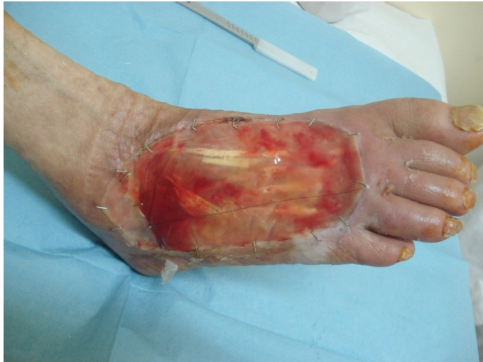
Figure 10. The same case as figure 7. View of the ulcer 3 weeks after the application of the Integra dermal substitute.