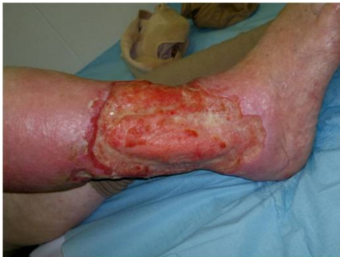
Figure 1. Lympho-venous ulcer of the right leg lasting for more than 12 months.

At the follow-up on the third day after surgery, all patients reported a substantial reduction in local pain (median VAS 3.8, range 1–6) which allowed 88 (23.1%) patients to suspend the