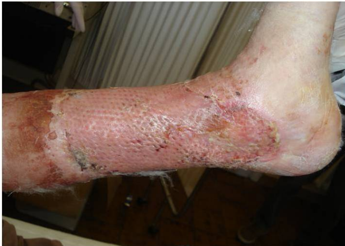
Figure 6. The same case as figure 1. View of the wound 2 weeks after thin skin graft, which is completely attached.