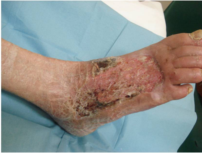
Figure 11. The same case as figure 7. View of the wound 2 weeks after thin skin graft..

In all patients, at the first follow-up, a notable reduction in the exudate and the perilesional oedema was ascertained. After 2 weeks the progressive substitution of granulation tissue with new yellow or gold derma became evident through the layer of silicone. Only in 50 cases (7.7%) was it necessary to partially remove the layer of silicone because some areas showed abundant yellowish exudates under the lamina. The neodermis, remaining thus uncovered and without protection, was covered with hydrofibrous and silver dressings, although that did not prevent, even in these patients, the complete formation of the neodermis.