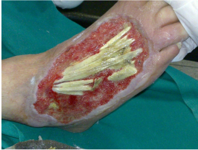
Figure 7. Neuropathic ulcer of the right leg.