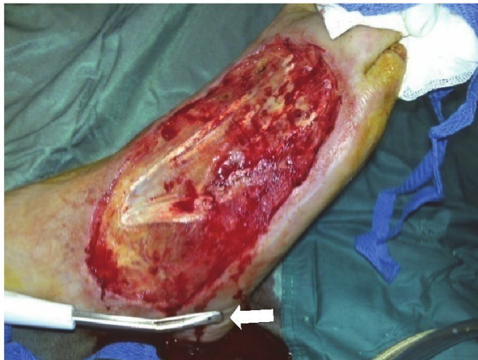
Figure 8. The same case as figure 7. Intraoperative view during wound debridement with Versajet hydrosurgery (arrow).