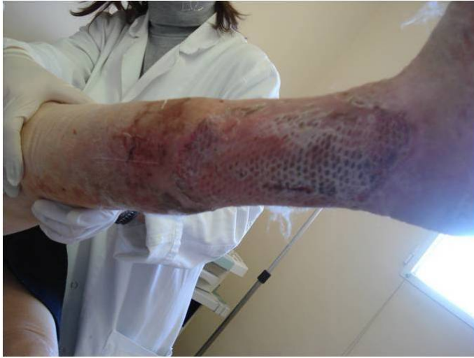
Figure 5. The same case as figure 1. View of the wound at the end of thin skin graft