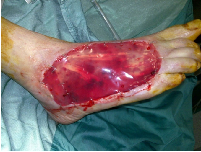
Figure 9. The same case as figure 7. View of the ulcer 1 week after the application of the Integra dermal substitute.