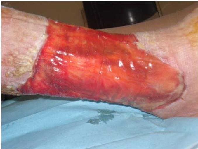
Figure 4. The same case as figure 1. View of the ulcer 3 weeks after the application of the Integra dermal substitute. The new dermis is completely reconstructed, and the wound is ready for the epidermis skin graft.