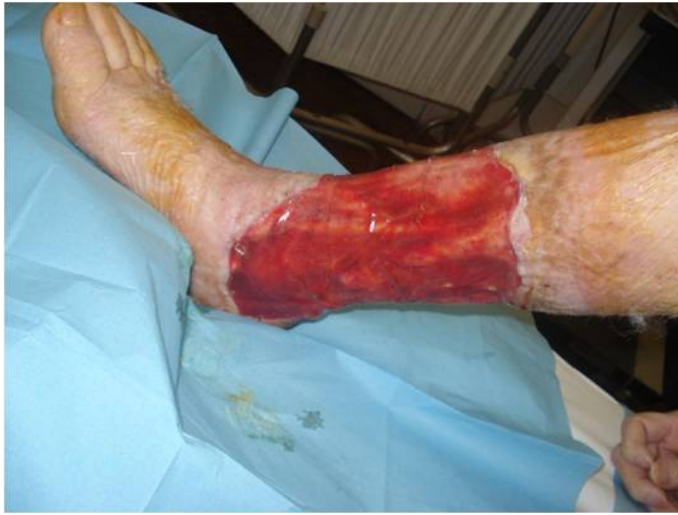
Figure 3. The same case as figure 1. View of the ulcer 1 week after the application of the Integra dermal substitute. The brightness of the silicone layer is evident.